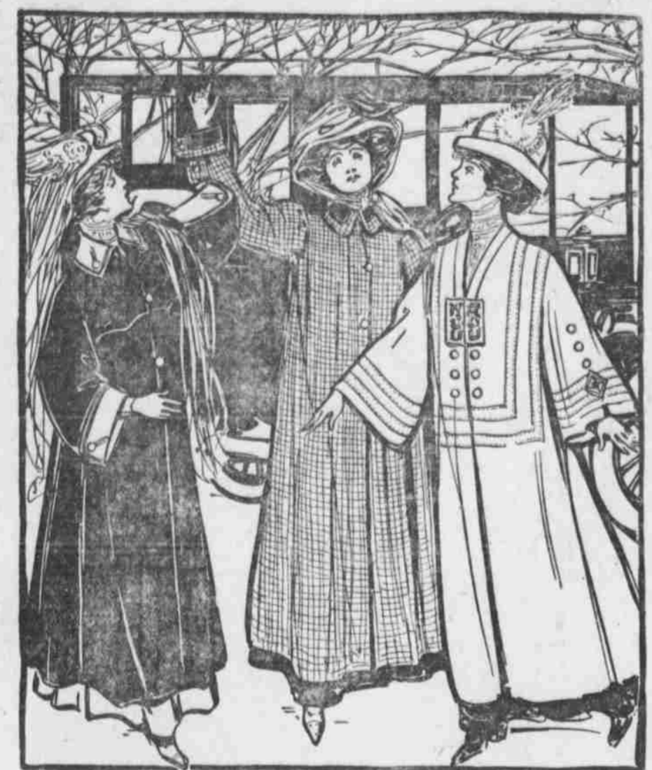
MOTOR COATS OF BLUE SERGE WITH RED CLOTH COLLAR AND CUFFS, OF BLACK AND WHITE CHECK WITH RED LEATHER TRIMMINGS, AND RED CLOTH WITH BURS OF BARKBERRY.

THE day of the fur motor coat is almost past, and already there is a brisk sale of cloth coats warm enough for spring and autumn wearing, yet not too heavy for certain summer uses.