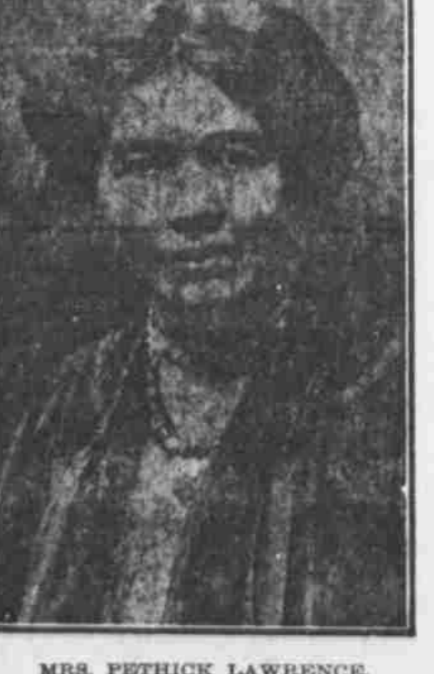
MRS. PETHICK LAWRENCE.

Mrs. Pethick Lawrence, a quiet, thoughtful woman, who speaks well and edits the paper, Votes for Women.