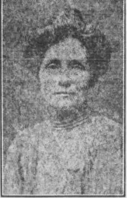
MRS. PANKHURST, FOUNDER OF THE WOMEN'S SOCIAL AND POLITICAL UNION.

patience which had marked their campaign for years. Then stepped forward the Gracchi, as they are called, the three offspring of that militant Roman matron, Mrs. Pankhurst.