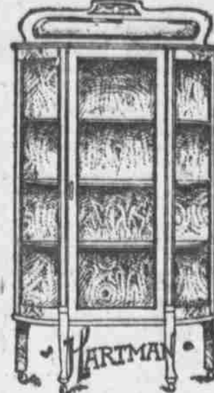
Massive China Cabinet Solid Oak, Best End Design 1250

These China Cabinets are of expert workmanship throughout, double strength glass, shelves grooved for standing plates, hand-carved and polished. A rare saving opportunity.