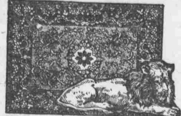
RUSSSELLS RUG 7.75

They have large 24 inch top, strongly made and beautifully finished. Made in solid oak or with mahogany veneer.