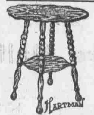
This Solid Oak or Solid Mahogany Veneer Center Table $1.98

They have large 24 inch top, strongly made and beautifully finished. Made in solid oak or with mahogany veneer.