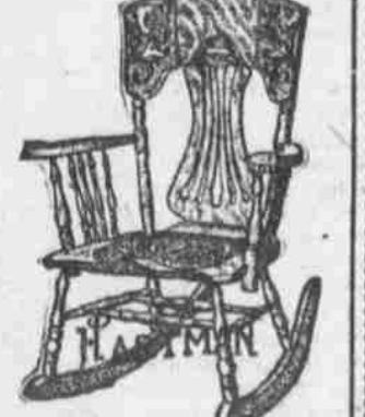
This Solid Oak or Mahogany Finish Rocker $3.45

These Rockers are hand-carved, upholstered leather, cushioned seat. They are very comfortable, strong and substantial.