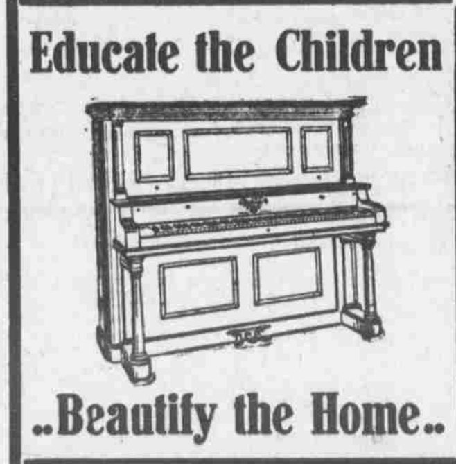
..Beautify the Home..

Second-Hand Pianos During this great sale of High-grade Standard Pianos we have taken in exchange some first-class Pianos which we have gone over and thoroughly overhauled.