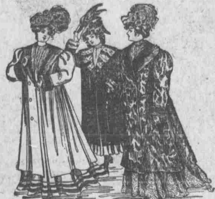
LADIES' LONG COATS

EASY PAYMENTS TO ALL THOSE THAT WISH IT : :