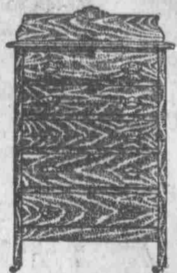
Live Drawer Solid Oak Chest 5.75

This heater is made for burning coal, wood or coke. It burns any of these fuels with the very best satisfaction. It is an exceptionally economical heater, elegantly trimmed with nickel and has large cast ornamental base. Patent air circulation, is gas consuming.