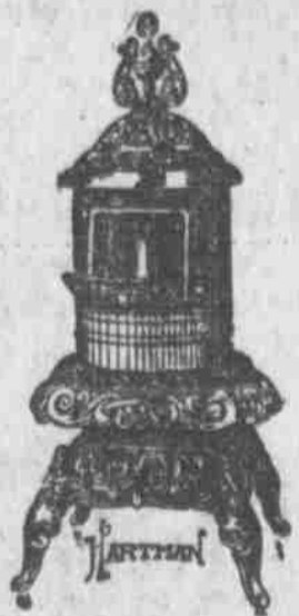
No. Blast Heater 6.75

You never before saw a base burner of equal character sold at the price at which this one is offered. It is a splendid heater, has automatic feed, patent duplex shaker grate and many other improved features.