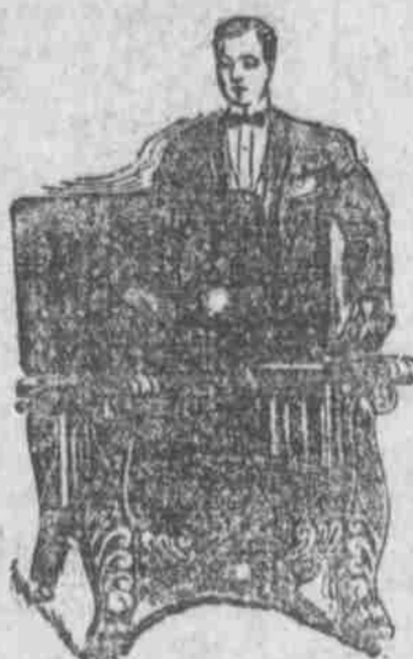
Fine Morris Chair Nantucket, Lea her 6.45

On this page today we tell of genuine saving opportunities which should prove exceedingly interesting to those who know the real value of money and who desire to make their dollars accomplish the utmost in the purchase of reliable homefurnishings. This is a special value-giving week at Hartman's—a week of extraordinary pricing. All the resources of this great organization, with its twenty-two big stores are exerted in our endeavor to force prices downward. The splendid values here illustrated and described are on sale at our Omaha store. Every article is of Hartman's high standard of quality, and every offering is a value of the most unusual character. We invite you to take advantage of this trade movement and share in the rich savings. We invite you also to open a Credit account and enjoy the use of your goods while paying for them. No payments required when you are ill or out of work.