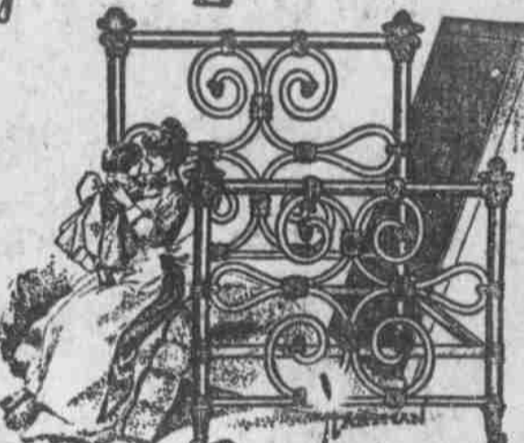
Complete Outfit, Consisting of Bed, Spring and Mattress, 10.25

The bed in this outfit is just like above illustration. It is strong and substantial, of handsome design and heavily enameled in any color desired. The springs have heavy durable maple frame and best woven wire fabric. The mattress is of splendid quality, made in our own factory and thoroughly guaranteed. This offering should prove to your mind which concern gives the greatest values. This special is on sale all week.