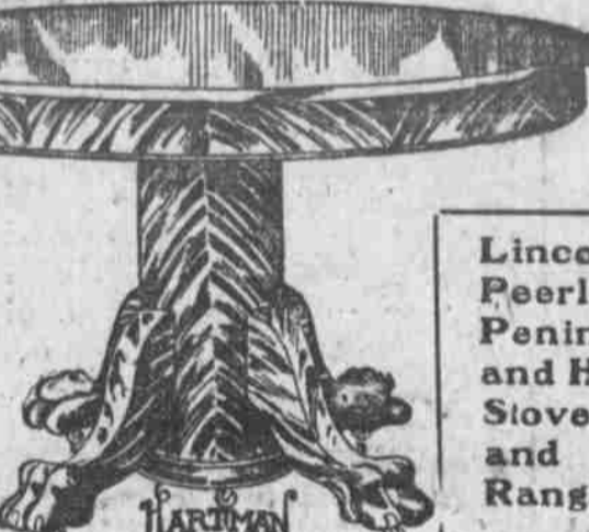
Quartered Oak Pedestal Extension Table 16.75

Made in solid quarter sawed oak, bird's-eye maple or mahogany. A dainty and beautiful piece of furniture, beautiful rubbed finish. Roomy drawers, large bevel edge, French plate mirror, set in carved frame and standards.