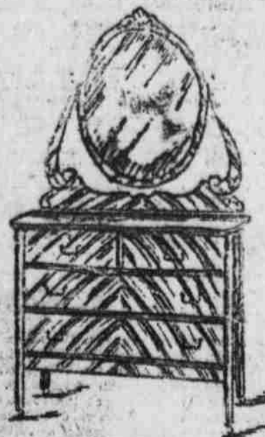
Dresser. (Like Cut.) Solid golden oak, rubbed finish, large full size dresser, with swell top and top drawers, top 20x40 in., French bevel mirror 28x22 inches; special at, each..... $13.50