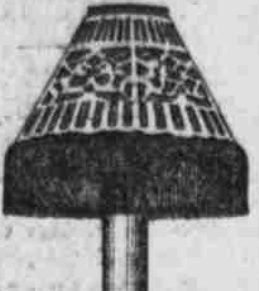
Silver Candle Shade. (Like Cut.) Made of the cut silver, with a pretty colored design and silk fringe, 6 1/2 inches in diameter at base; will fit any size of holder. This is a beautiful shade and always sold at a low price. Special Saturday (complete with trimmings), each..... 40c