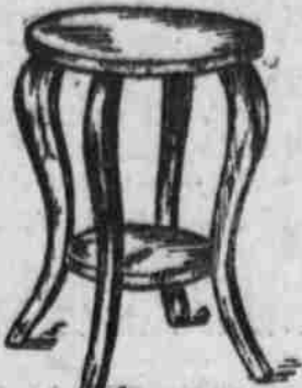
Stool. (Like Cut.) Solid golden oak or weathered finish, has undershelf, is 18 inches high, top is 13 inches in diameter, sells regularly at 85c. Special Saturday only, each 60c

We offer selection from the largest assortment and give the best values.