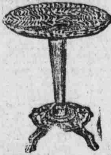
Parlor Table. (Like Cut.) Thoroughly constructed of select quarter-sawn golden oak, hand polished to a high finish, pretty pedestal pattern, heavy and rich claw feet effect, pattern round top 24 inches in diameter, an extra good value at, ea., $8.00