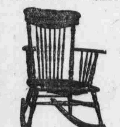
Oak Rocker (like cut)—Made of well selected oak with handsomely embossed cobbler seat, the best value ever offered in the city at our sale price $2.50