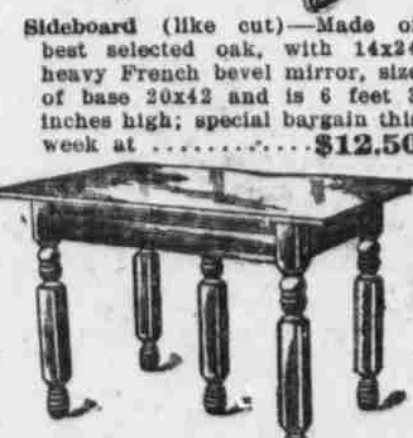
Solid Oak Extension Table (like cut)—Strongly made of thoroughly seasoned oak and finely finished, top closed 42 inches square, extended 42 inches by 6 feet; great bargain at $4.50 Sanitary Steel Couch (like cut)—Has three rows of oil tempered coil springs supports and forty-six helical springs at ends, couch 27 inches wide when closed, bed 4 feet wide 6 feet 2 inches long when open; special bargain at $3.50 Same in Davenport style on sale at $4.50

Special Reduced Prices on All Framed Pictures During This Entire Week. Don't Miss Them.