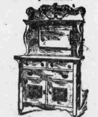
Sideboard (like cut)—Made of best selected oak, with 14x24 heavy French bevel mirror, size of base 30x42 and is 6 feet 3 inches high; special bargain this week at $12.50