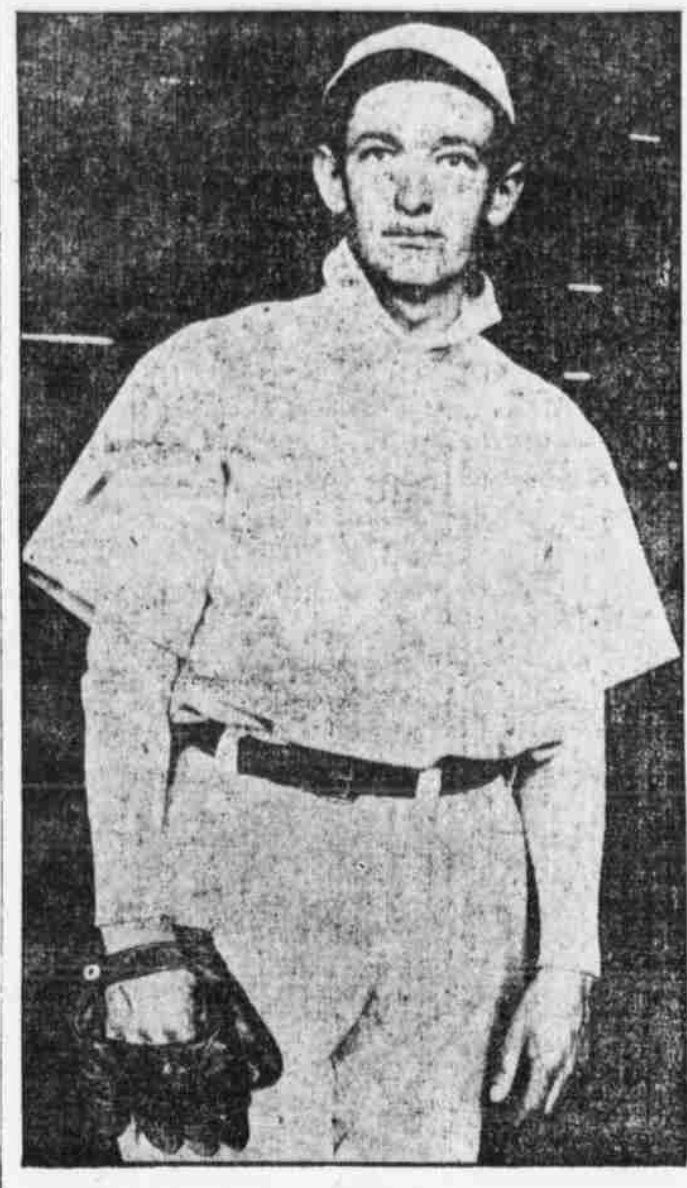
Omaha's Left Fielder, Who Will Play in the Outfield for the Cincinnati Reds Next Season.