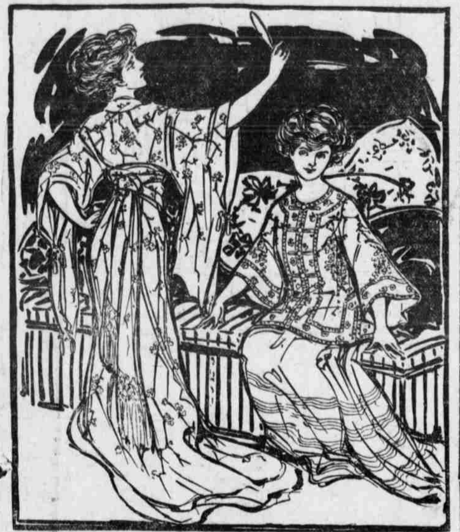
PINK SILK KOMONO EMBROIDERED WITH CHERRY BLOSSOMS AND A JACKET OF WHITE CREPE WITH A PINK BORDER.

skirt, others have extra fullness let into the back seam from the waist down which makes them more comfortable and graceful from a western point of view. The obi is made exactly like the gown, and is really more in the nature of a sash having heavy silk fringe on each end. There are pretty kimono jackets in plenty with embroidered bodies and plain silk borders, but much more fascinating are the Chinese jackets, made in Japan, to be sure, but thoroughly Chinese in style. One of these is shown in the sketch and two lovely models may be described. One white crepe embroidered with wistaria has a border of white satin thickly embroidered with small flowers. This border has a band of pink on either side in which are little touches of gold. The second, of soft white satin, is embroidered with sprays of chrysanthemums, while the blue border has an embroidered figure here and there and a delicate design in gold thread on its edge. Bewitching little suits of pajamas in white, pale blue or pink China silk or pongee are shown. One suit in white has sprays of pink cherry blossoms embroidered around the edge of the jacket, while another in light blue China silk has a band of white embroidered with pink roses down the front of the jacket. Magnificent mandarin robes, the genuine thing, with no western modifications and only such alterations as are needed to make them fit, are used for evening coats. One of a wonderful old gold brocade was embroidered with Chinese embroideries in dull shades.