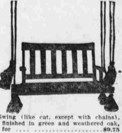
Swing (like cut, except with chains), finished in green and weathered oak, for $9.75

PORTIERES This stock represents a large assortment of one-pair lots of the choicest styles shown. Popular colors and fine fabrics. $11.75 Portieres, sale price $7.75 $10.75 Portieres, sale price $5.95 $6.75 Portieres, sale price $3.50 $7.50 Portieres, sale price $4.75 $9.50 Portieres, sale price $6.00 $13.50 Portieres, sale price $9.25 $8.75 Portieres, sale price $5.25 $22.50 Portieres, sale price $16.50 $17.50 Portieres, sale price $12.75 $3.50 Portieres, sale price $2.25 $3.00 Portieres, sale price $1.25 $4.25 Portieres, sale price $2.95 $5.50 Portieres, sale price $3.75 SEE OUR NEW STOCK OF COUCH COVERS