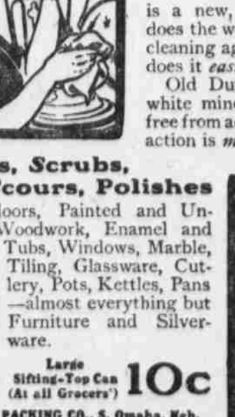
THE CUDAHY PACKING CO., 5. Omaha, Neb.

is a new, natural cleanser that does the work of all old-fashioned cleaning agents put together, and does it easier, quicker and better. Old Dutch Cleanser is a fine, white mineral powder, absolutely free from acid, caustic or alkali. Its action is mechanical, not chemical.