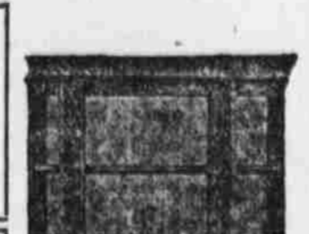
$20.75 Golden Oak China Cabinet, full bent front, for $15.75