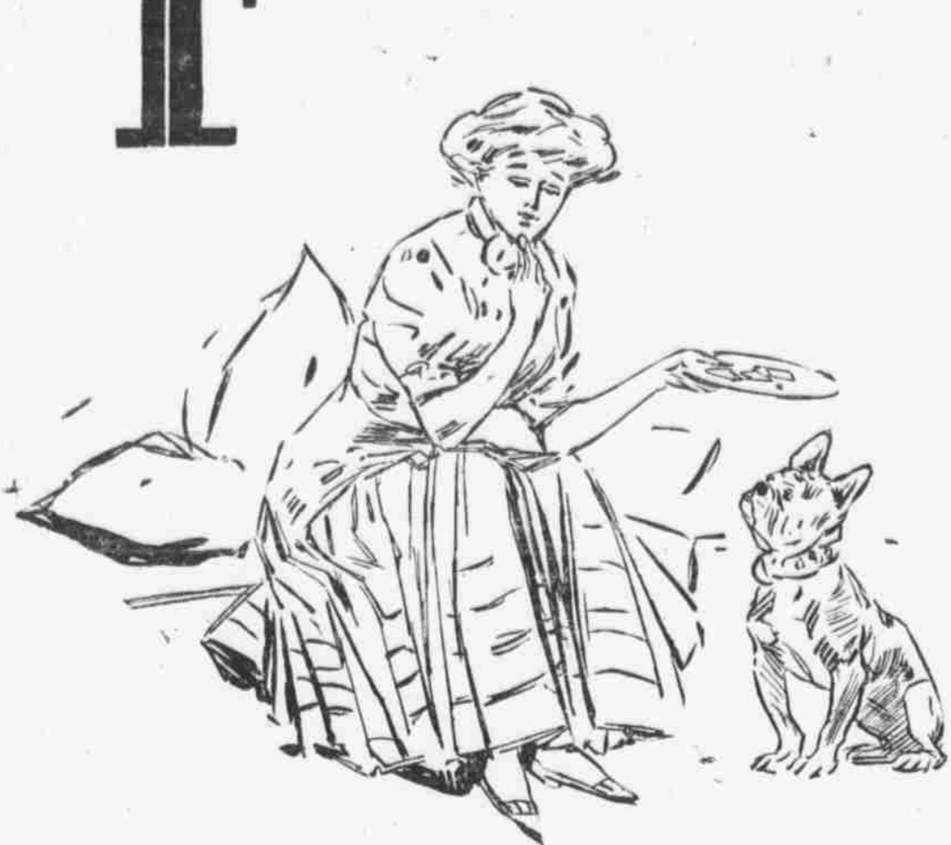
1.—A smile appeared on Fluffy's face, the frown cleared from her brow: "I think," she said, triumphantly, "I see my way clear now. I'll have a candy kitchen! Unless I much misjudge, The public will be very glad to buy my walnut fudge."