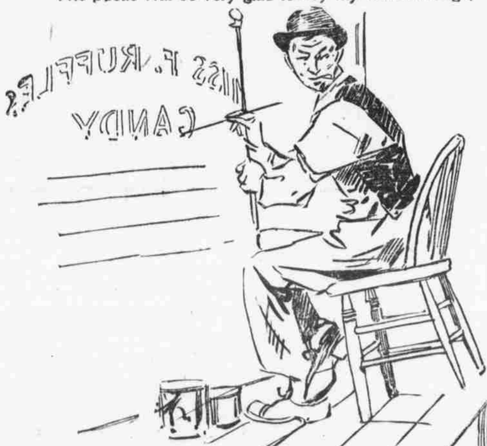
3.—Upon a fashionable street she rented a small store, Had "Candy Kitchen" painted in gilt letters on the door. She had it furnished daintily, in nickel and white tile; "For much depends," Miss Ruffles said, "upon its tone and style."