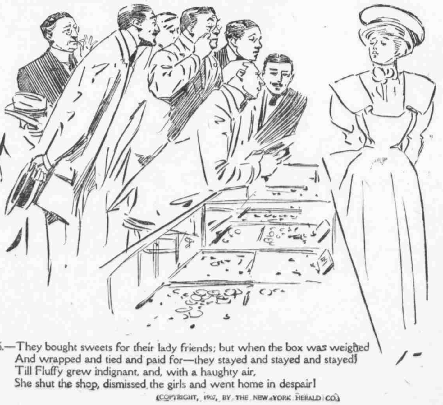
6.—They bought sweets for their lady friends; but when the box was weighed And wrapped and tied and paid for—they stayed and stayed and stayed! Till Fluffy grew indignant, and, with a haughty air, She shut the shop, dismissed the girls and went home in despair!