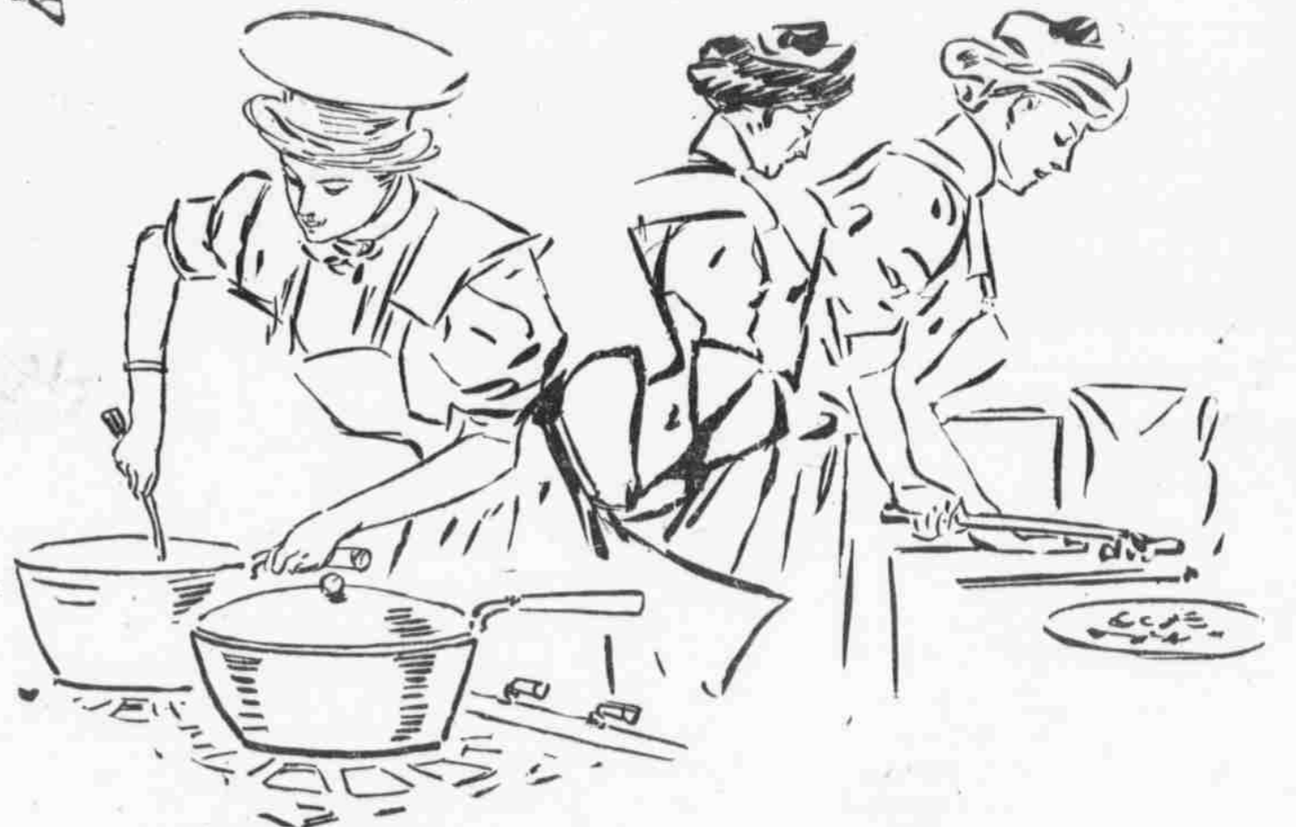
4.—She had a few assistants—some girls all garbed in white; But Fluffy made the candy, as she wished to have it right. She boiled the sugar to a thread, the fondant stirred with care; While the nuts and fruits and chocolate she let her aids prepare.