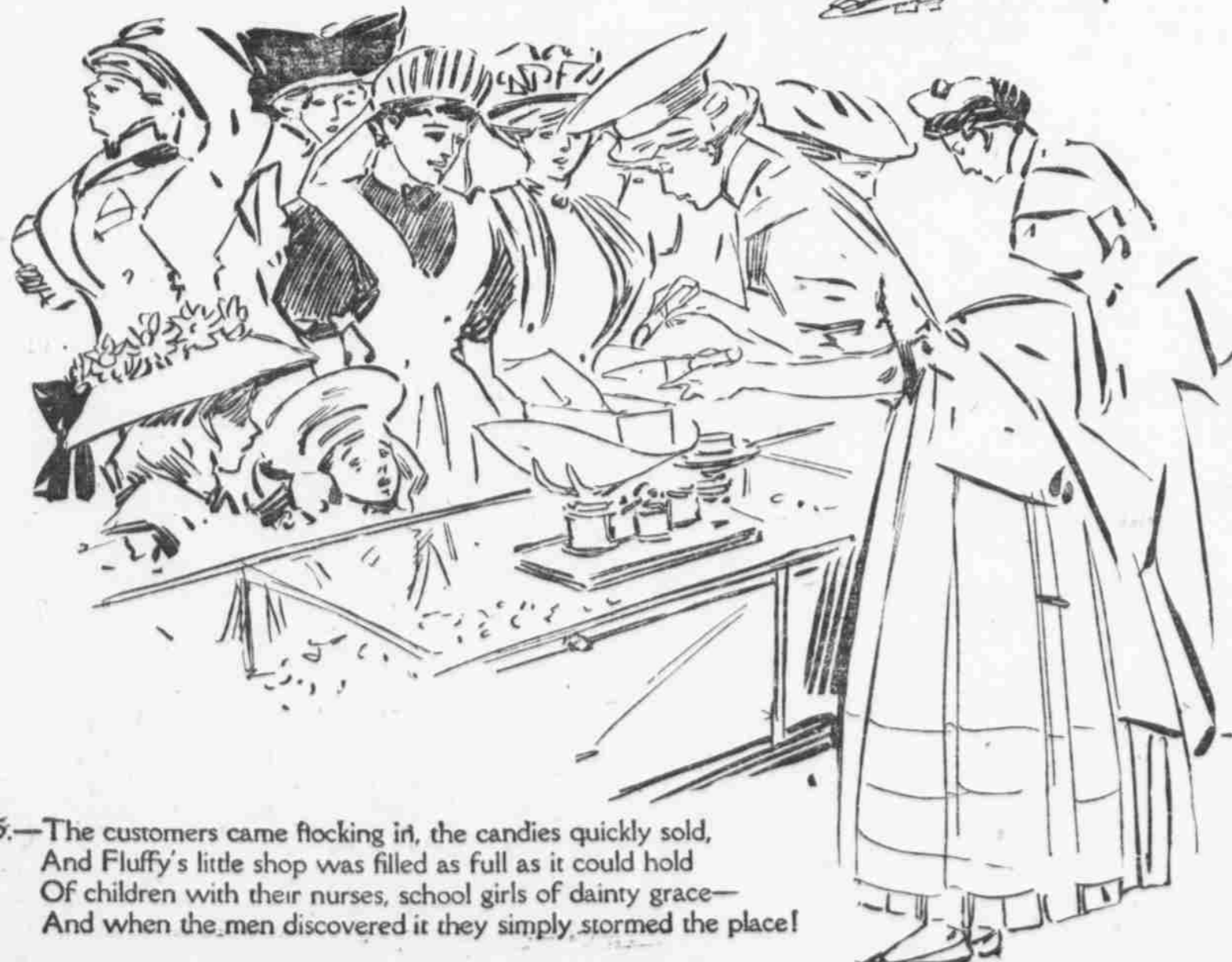
5.—The customers came flocking in, the candies quickly sold, And Fluffy's little shop was filled as full as it could hold Of children with their nurses, school girls of dainty grace— And when the men discovered it they simply stormed the place!