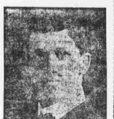
HARRY CHAIM (Pictures)