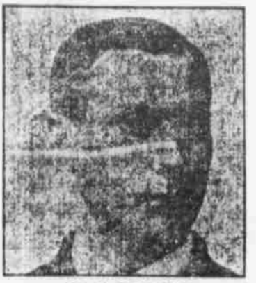
M. J. MALONE (Hosiery, Gloves, Handkerchiefs)