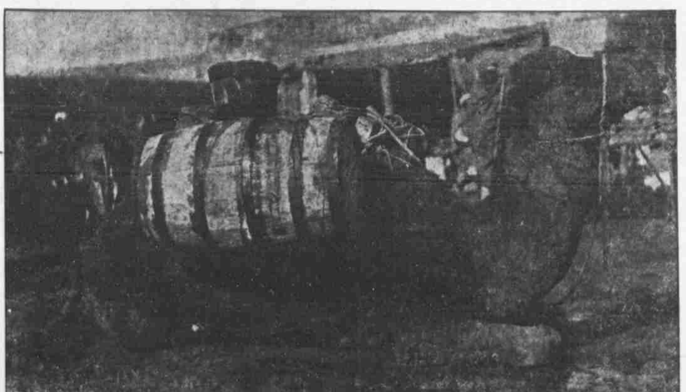
PART OF THE TRIPOLI WATER WORKS.