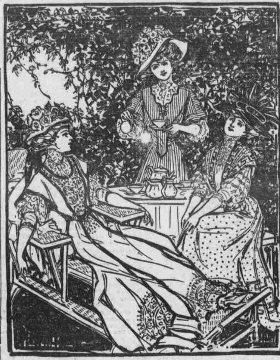
GOWN OF BLUE TISSOR TRIMMED WITH BLACK AND TWO SIMPLE SILK FROCKS, ONE OF STRIPED TAFFETA, THE OTHER DOTTED FOUILLARD.

of ready-made cotton frocks to the most elaborate and elegant of Parisian visiting and costume frocks, and the idea is illustrated in the simple jumper frocks as well as in the costume of more pretentious character.