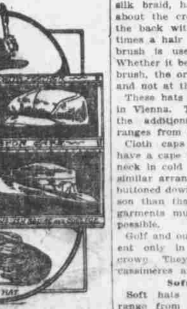
Soft Hats Are Many.

Kind of straw that will be smartest throughout the summer. He did not make a mistake if he buys a rough straw of moderately high crown and moderately brim.