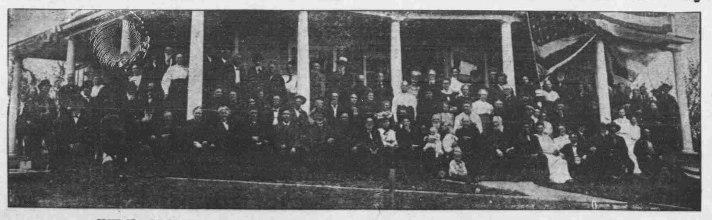
GROUP OF THE EARLY SETTLERS OF CASS COUNTY TAKEN AT A REUNION AT THE M'MAREN HOME AT PLATTSMOUTH ON MAY 22, 1997.