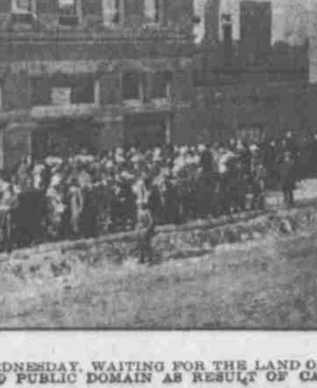
LINE UP AT NORTH PLATTE LAST WEDNESDAY, WAITING FOR THE LAND OFFICE TO OPEN—SETTLERS EAGER TO FILE ON LANDS RESTORED TO PUBLIC DOMAIN AS RESULT OF CATTLE CARES.