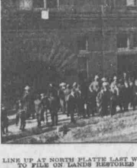
LINE UP AT NORTH PLATTE LAST WEDNESDAY, WAITING FOR THE LAND OFFICE TO OPEN—SETTLERS EAGER TO FILE ON LANDS RESTORED TO PUBLIC DOMAIN AS RESULT OF CATTLE CARES.