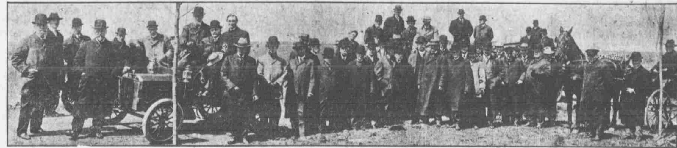
GROUP OF REAL ESTATE MEN WHO VISITED THE BEAUTIFUL TRACT.

Johnson-McLean Planning company, the Omaha Mitten and Manufacturing company, the Berback-Maloney Crockery company of Chicago and other concerns are still in the market for choice locations.