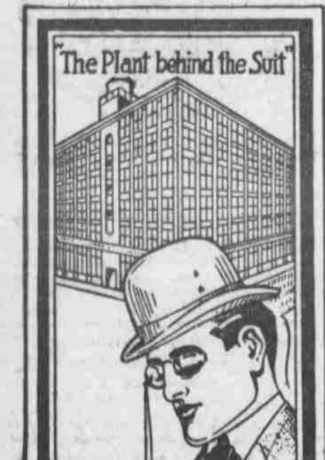
The Plant behind the Suit