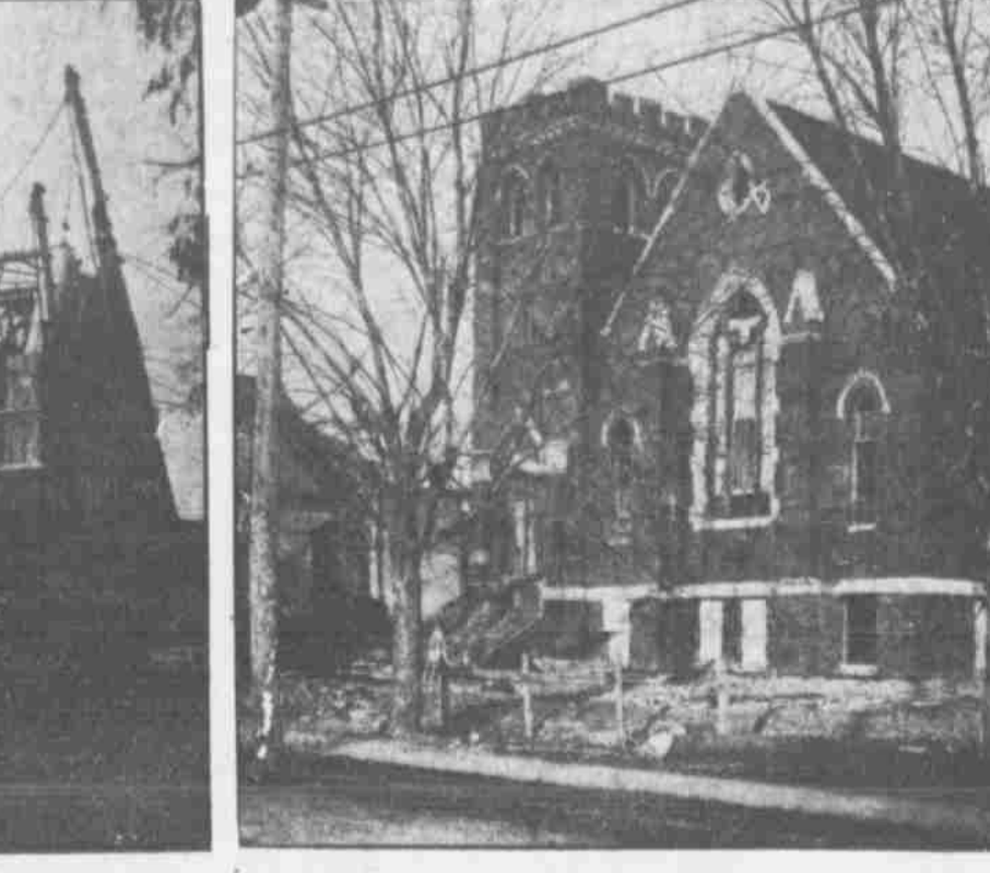
LOWE AVENUE PRESBYTERIAN, AT FORTIETH AND HAMILTON.

short and simple. The office has yet to learn of a single instance where a mistake has occurred which has in any way caused a loss to the property owner or raised any question as to the validity of his title.