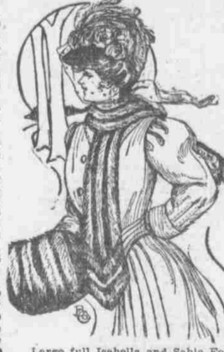
Large full Isabella and Sable Fox Muffs, one to five stripes, $6.98 to $17.50