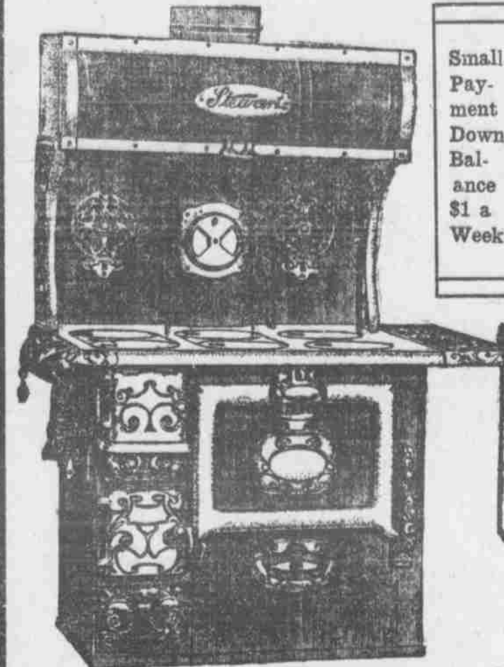
The Stewart Steel Range This exceptional range has stood the test of service for over seventy years. No other western home sells a range at this price. It is backed up by a legitimate guarantee by foundry and retailer. This range is made of best blue hammered Wellville steel, has spring hinged oven door, large steel warming closet, patent duplex grate, and for this week we sell this range for.....$33