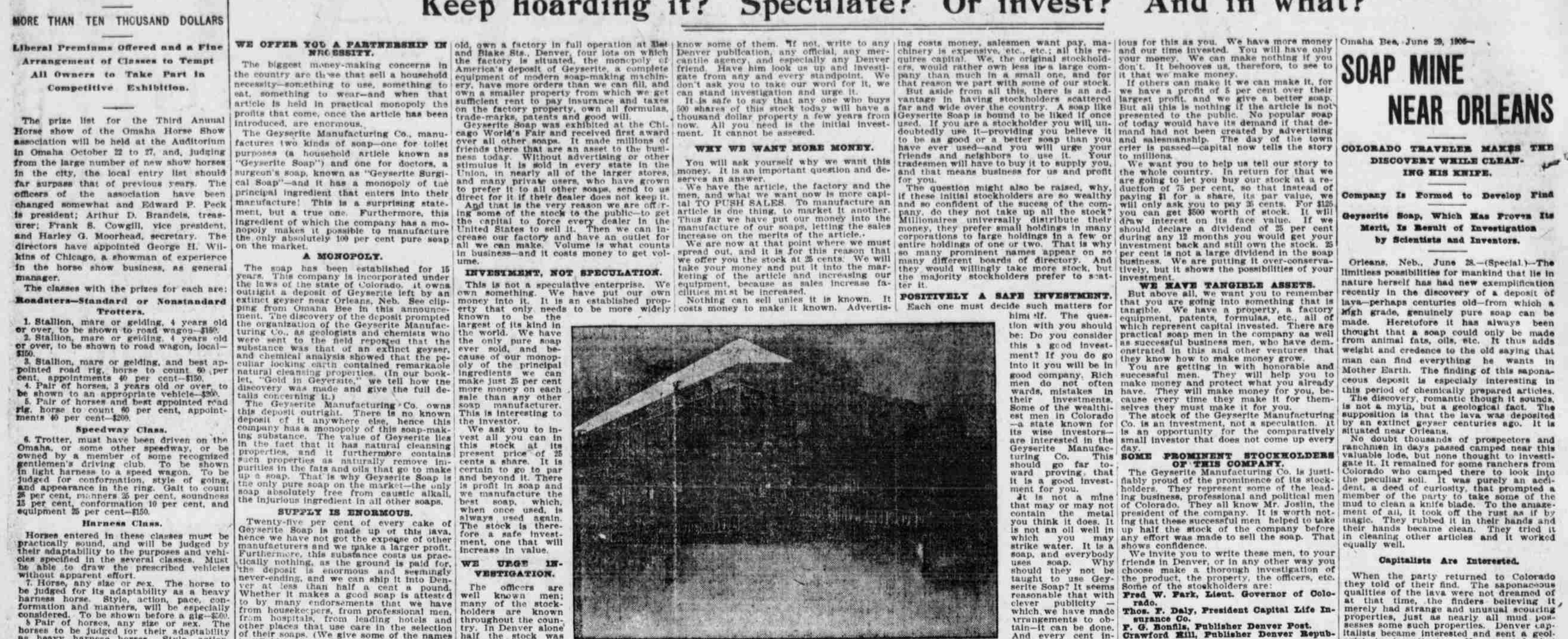
Original "Geyserite" Soap Factory Owned by the Company. Present Capacity 20,000 Cakes Daily.

The successful sale of the soap is re-markable, because it has depended entirely markable, because it has depended entirely upon one person recommending it to another, but even by this primitive method the sale has been extended into several countries. The commercial importance of the find is admitted by rival soap manufacturers, and other sections of the state are being prospected for similar deposits. At the present time it is believed that the Geyserite Soap company has a world monopoly of this soap deposit.