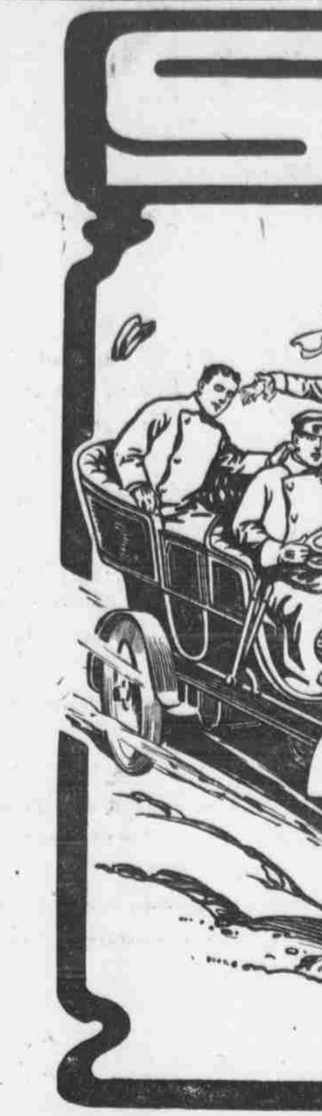
considerable damage done to railroad property, but no one was injured. The wreckage was not cleared up until Sunday morning, when traffic was resumed over the line.

GRAND ISLAND—Ransom Foss died at the Soldiers' home yesterday at the age of 74 years. He served in the war of the