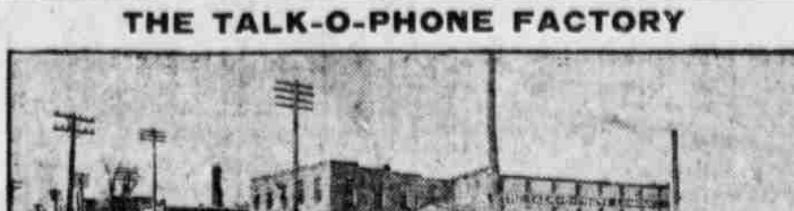
View from Central Ave., Showing Office Buildings in Foreground.