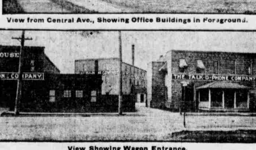
View Showing Wagon Entrance.