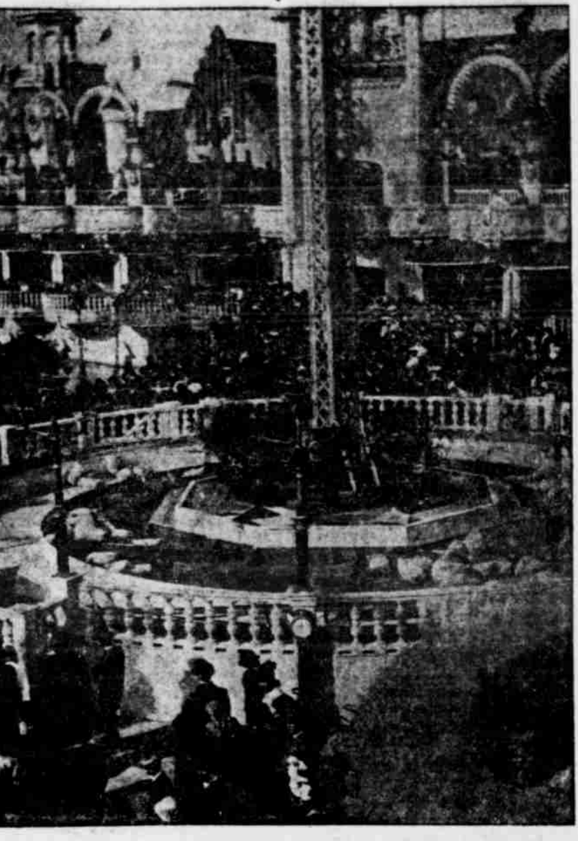
A CORNER OF THE MAIN COURT AS IT WILL APPEAR

Park will be most liberally advertised all ful fact.