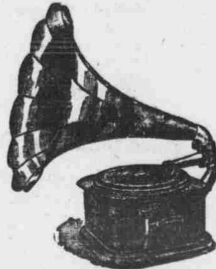
ONE OF OUR NEW MODELS

Machines Disc and cylinder—from $7.50 to $100.00. Columbia Graphophones and Records won Three Grand Prizes and Four Gold Medals at the St. Louis Exposition. This is more than all others combined received.