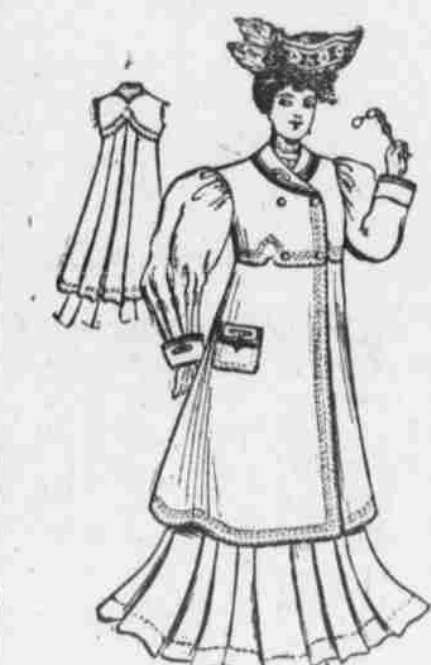
MONDAY FUR SPECIALS

$20.00, $18.50, $15.00, $12.50, $10.00 and 8.90