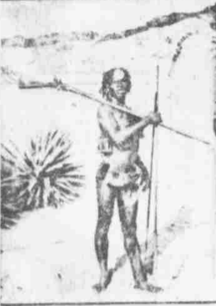
Magasawar soldier in marching equipment.