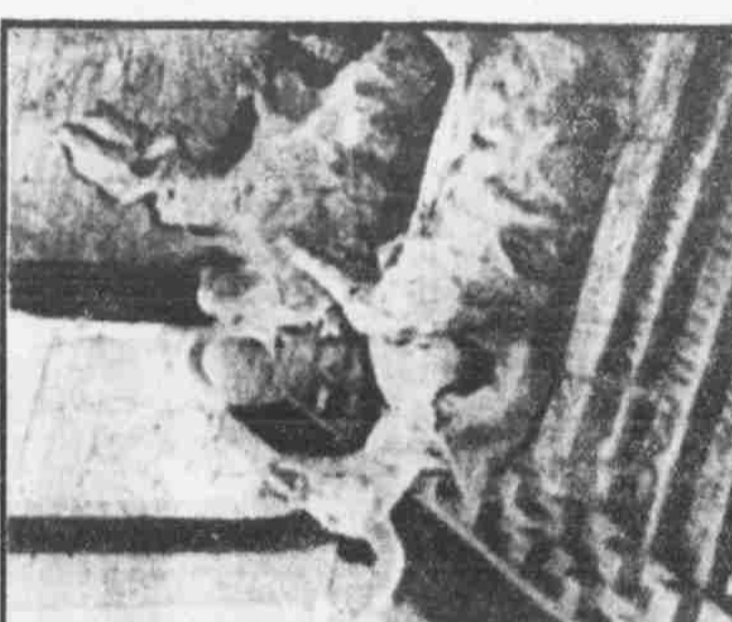
STUFFED YAKS OF TIBET.

Yaks are sacred with the Tibetans and they are honored even after death. Stuffed yaks shown in the picture are hanging about the gateway at Graung-jong. They were fitted with artificial eyes with their tongues protruding in a fierce manner.