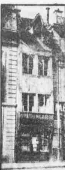
TEN FEET WIDE.

In one of the principal streets of the old Norman city of Rouen stands a house ten feet wide. A watchmaker occupies it.