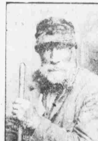
Peasant of central Tibet.