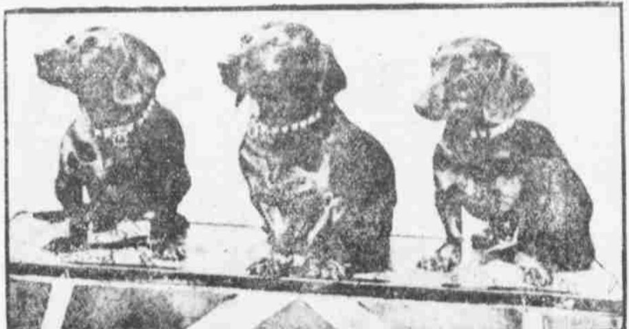
FAVORITES OF THE KAISER.

These three dachshunds are the favorites of William II. of Germany and his constant companions when he walks.