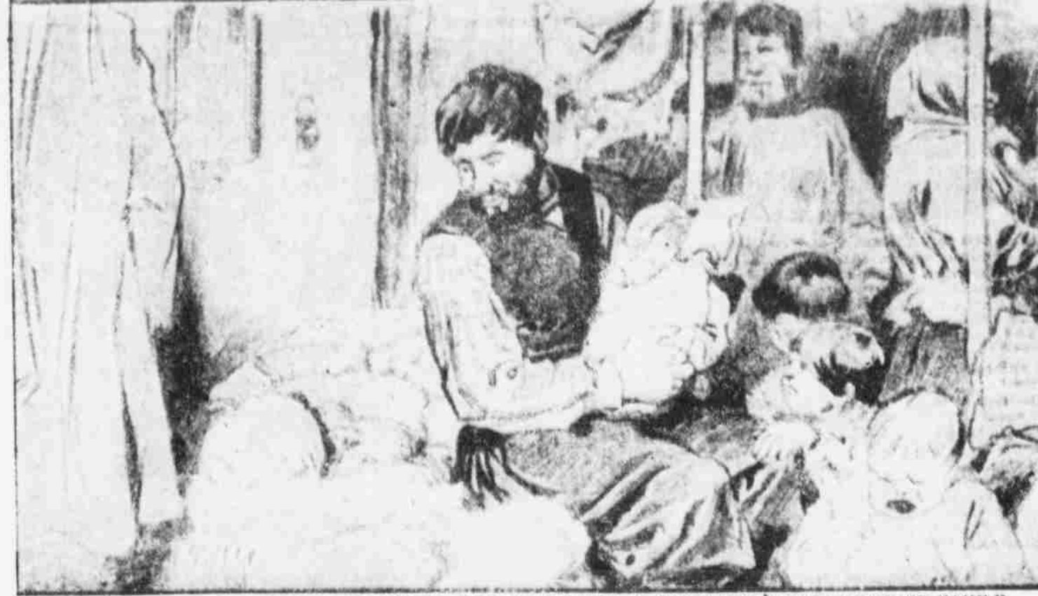
HALF A ROOM FOR A HOME: THE OTHER HALF BEHIND THE CURTAIN BELONGS TO ANOTHER FAMILY.