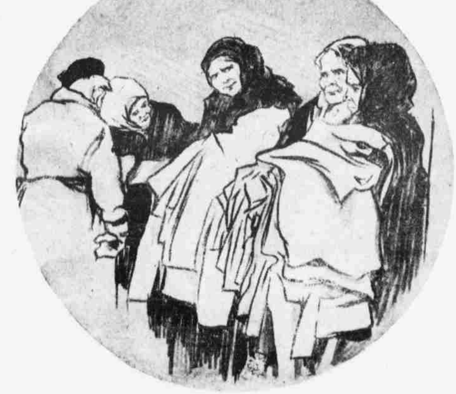
COMFORTS FOR THE BETTER OFF POOR: WOMEN PEDDLERS BEFORE A LODGING HOUSE OFFERING CLOTHES AND BLANKETS FOR SALE.