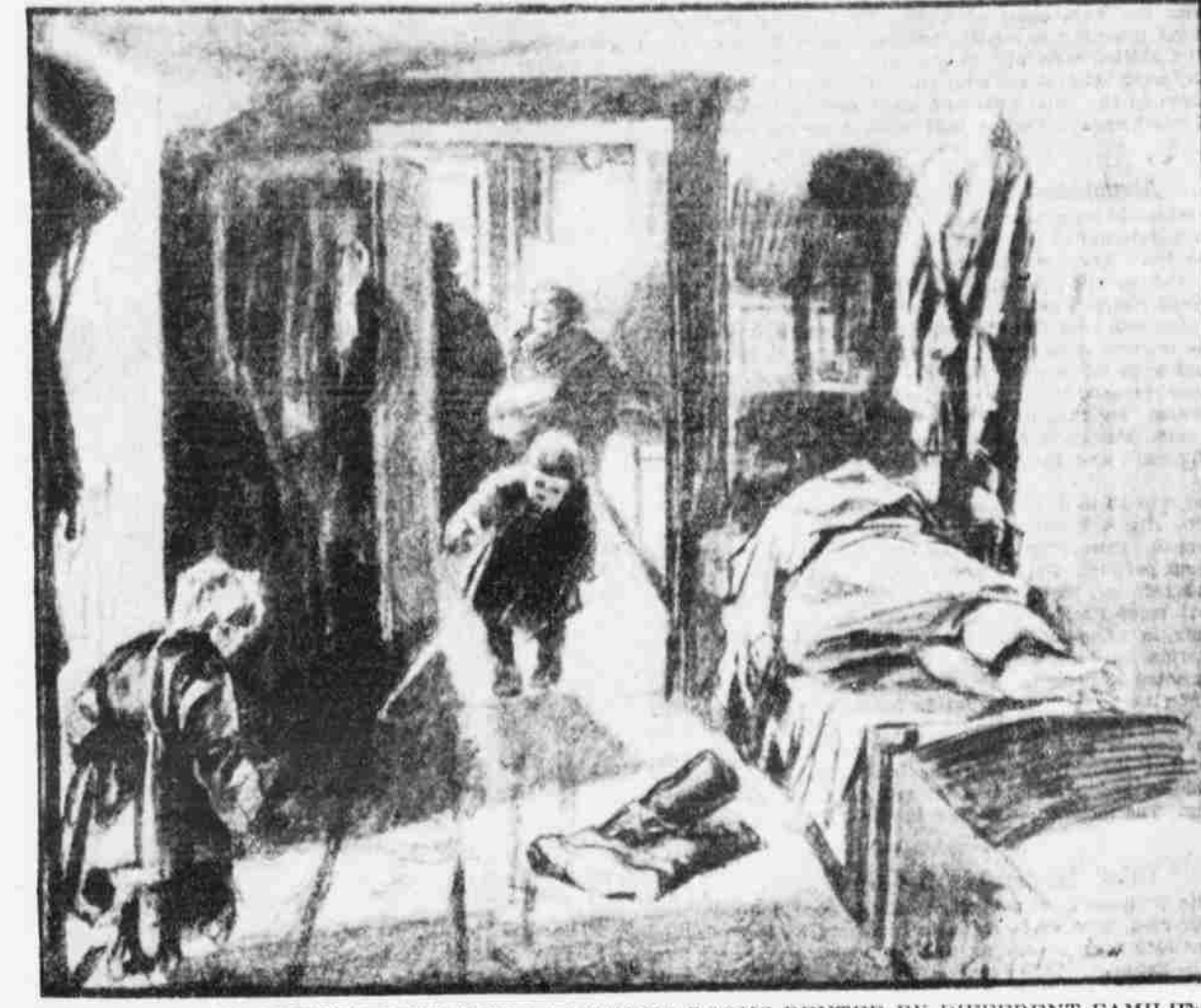
LIVING IN HALL, LIGHTED ONLY FROM ADJOINING ROOMS RENTED BY DIFFERENT FAMILIES.