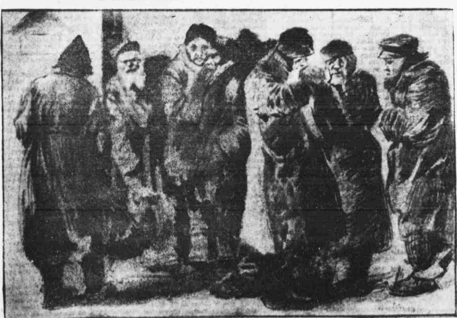
WAITING FOR ADMISSION TO A MUNICIPAL LODGING HOUSE.