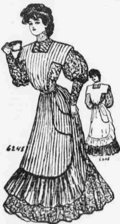
NO. 624—LADY'S APRON. Size 32 to 42.

For the accommodation of readers of The Bee these patterns, which usually retail at from 25 to 50 cents each, will be furnished at the nominal price of 10 cents. A supply is now kept at our office, so those who wish any pattern may get it either by calling or enclosing 10 cents addressed "Pattern Department, Bee, Omaha."