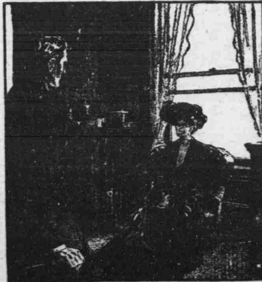
SHE SEATED HERSELF WITH HER BACK TO THE WINDOW.

"Remember also the curious earnestness with which he assured us that it was best for her husband that she should know all. What did she mean by that? And you must have