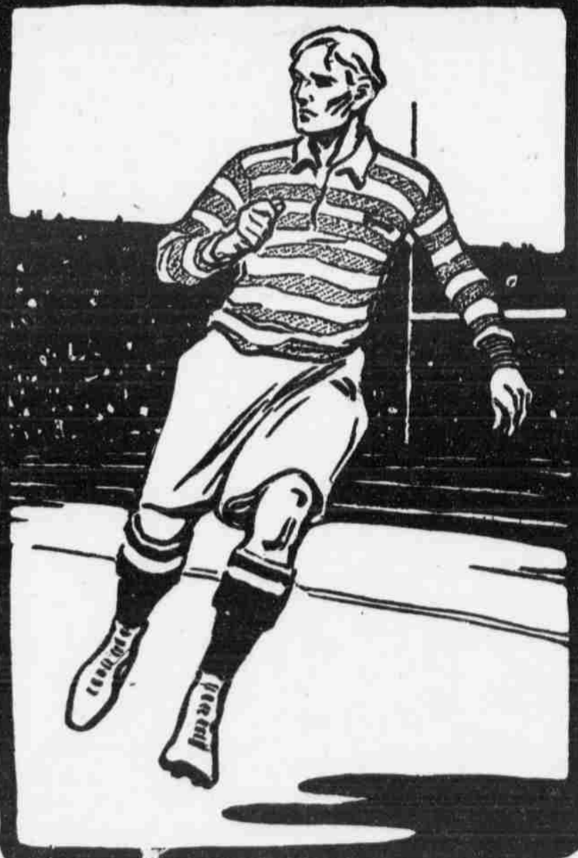
THE MISSING THREE-QUARTER.

time spare no pains, Mr. Detective! I beg you to leave no stone unturned to bring him safely back. As to money, well, so far as a fiver, or even a tenner goes, you can always look to me."