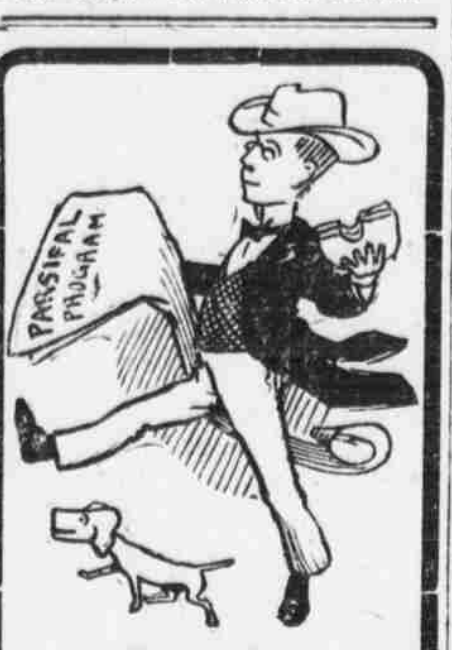
Parsifal Is Popular

Men's, boys', children's clothing, hats, ladies' suits, skirts, millinery, etc.; cash or credit. People's Store, 15th and Farnam.