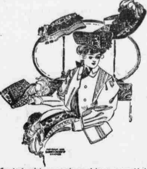
Greatest variety new spring models ever assembled

Ready-to-wear hats in a score of the new turban shapes, etc.—trimmed with the newest flowers, ribbons and ornaments—lots of style in these new hats—will go 3 98