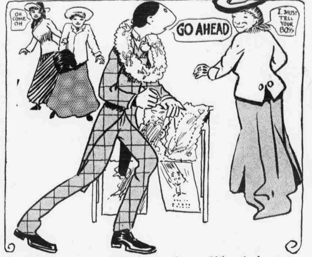
"You need not apologize, madam. Although I am a workingman, I have a soul above some forms of wit. I don't care if you DO report me. I'm not going to be anybody's comic valentine."