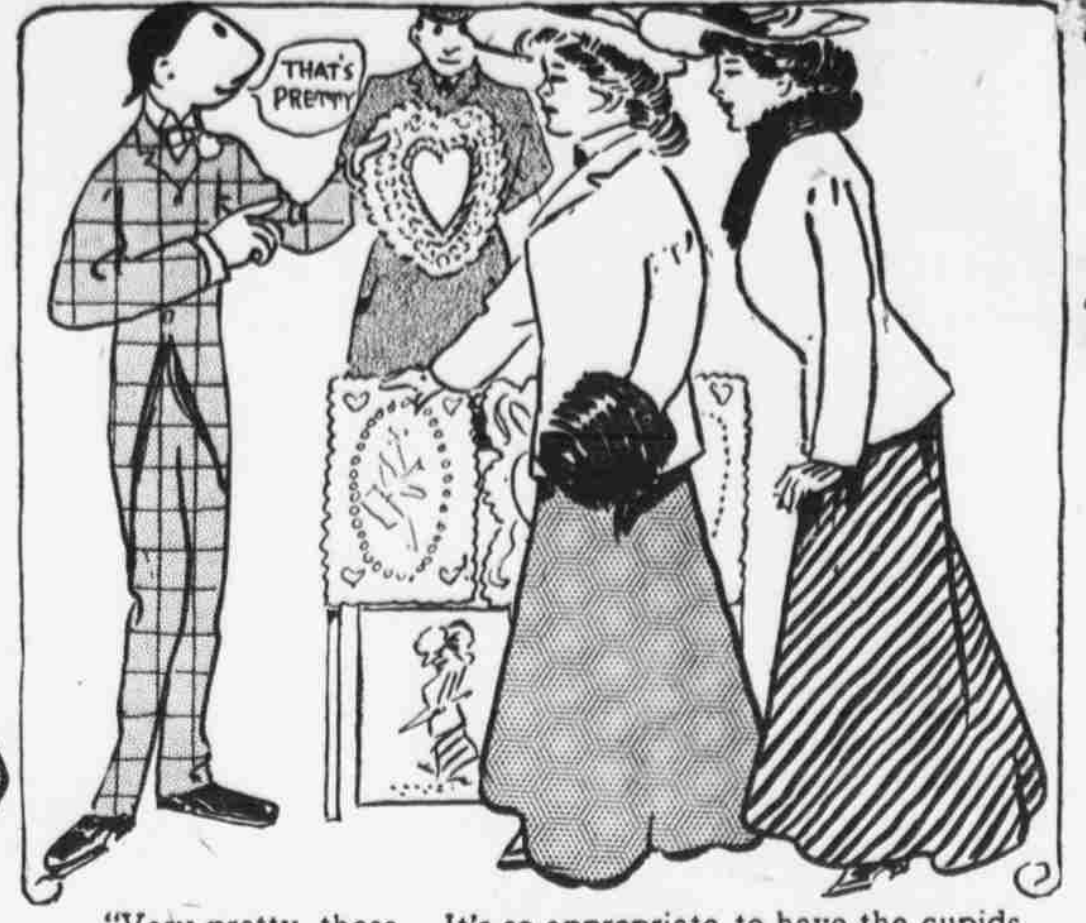
"Very pretty, these. It's so appropriate to have the cupids and birdlets gamboling about on them. This large one? It is intended for a symbolic gift."