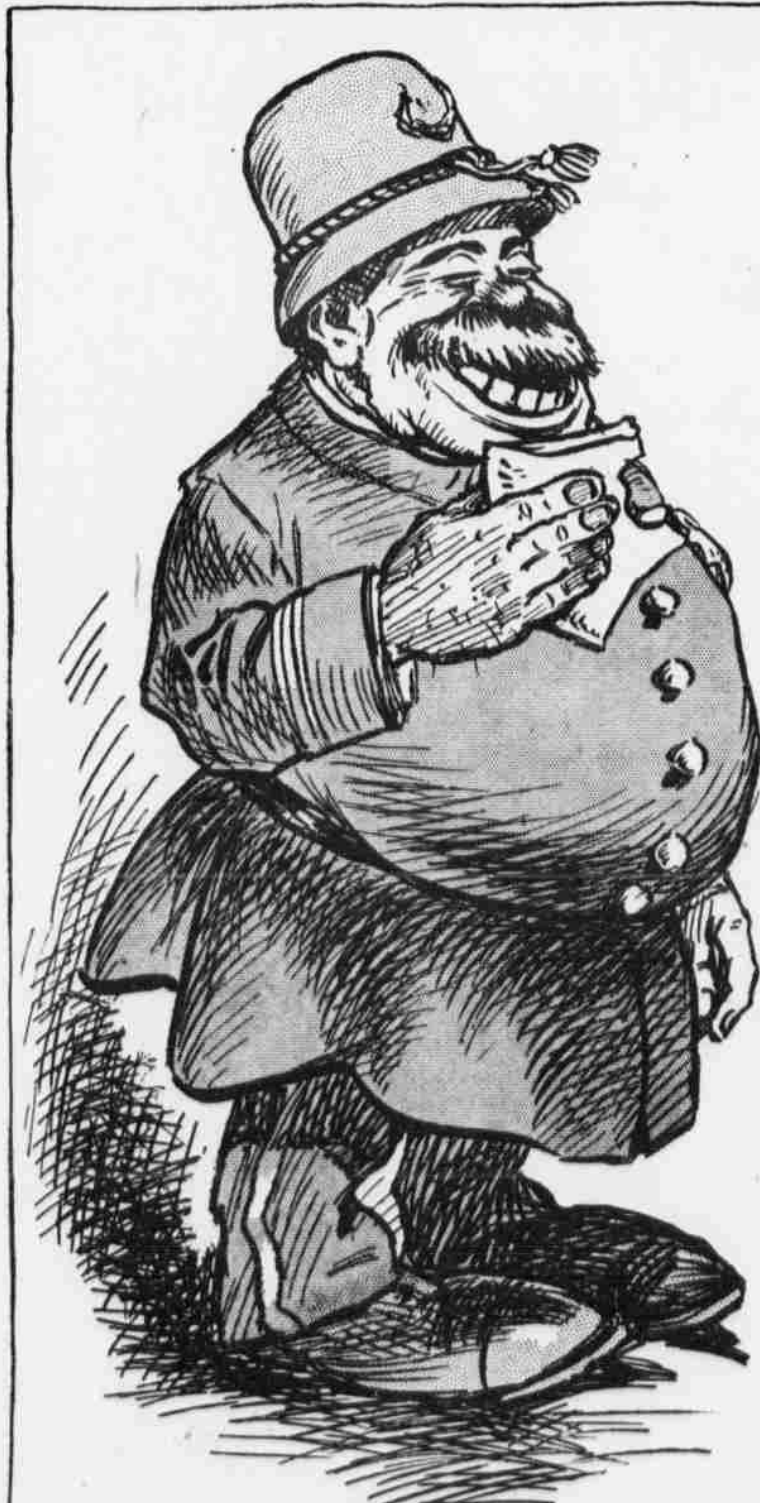
To a Faithful Officer.

The roundsman thinks you're on your beat— You're in our kitchen, where you eat The meat and bread and cakes and pies Some day you'll get a great surprise— The sergeant will learn you are tricky Unless you're good to