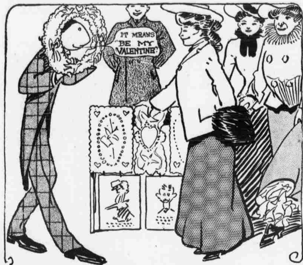
"It is meant as a frame for a photograph, you see. Quite a clever conceit. Means 'May I be your valentine?'"