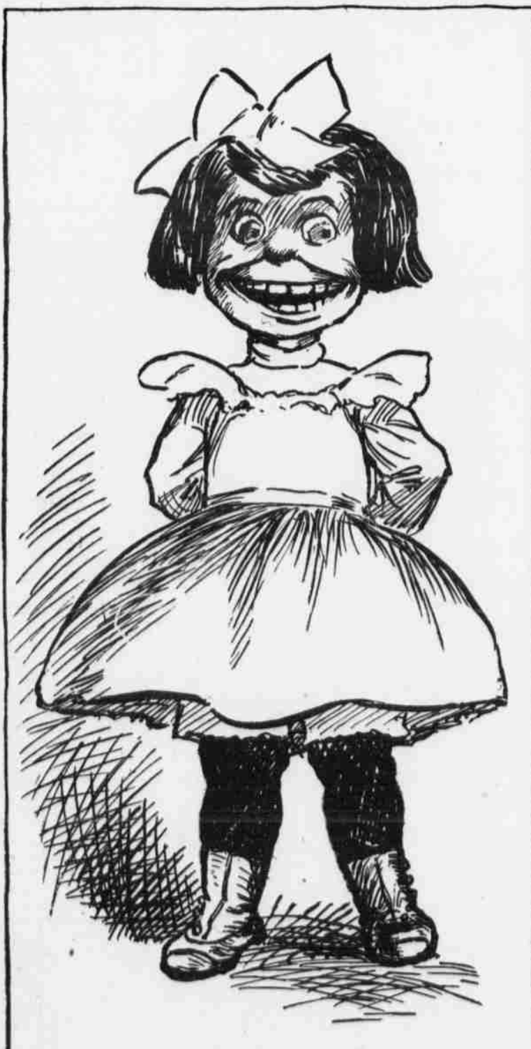
To a "Nice" Little Girl.

Whin' ye've a shmoilein' face I know Ye're up to thricks that fool me so. Whin' ye've a look that's schwate an' koin'd I'm watchin' ye, now, do ye moind? Wan day ye'll get some warrum touches From wan ye persecute.