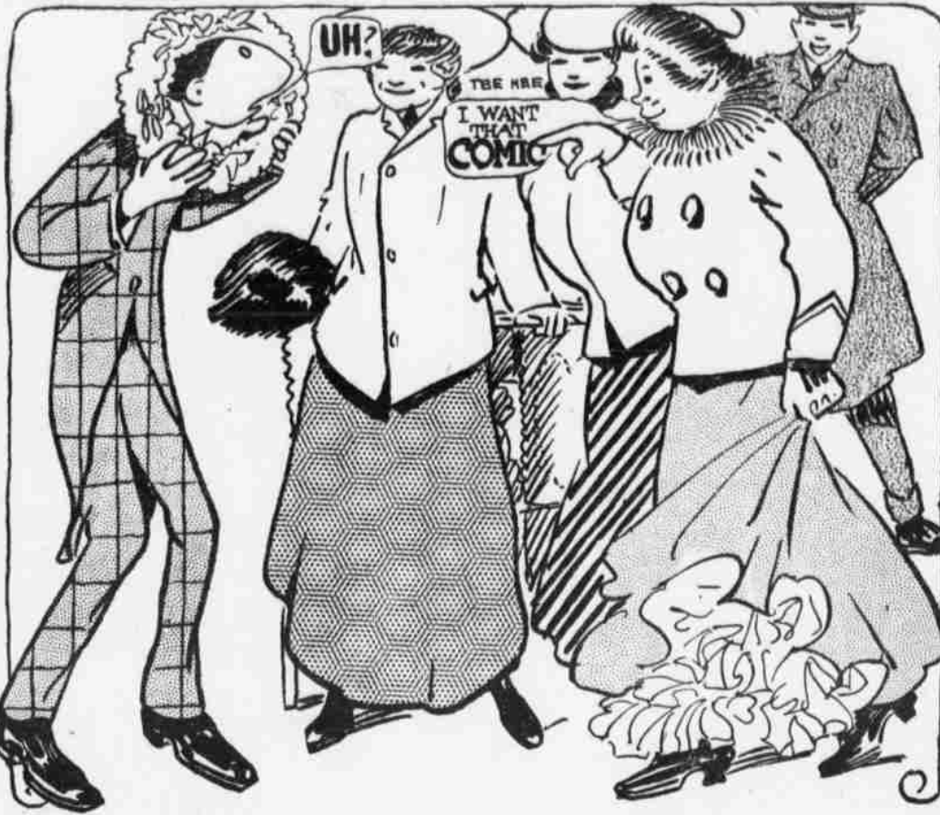
"What's that, madam? You'll take this comic? This is no COMIC!"