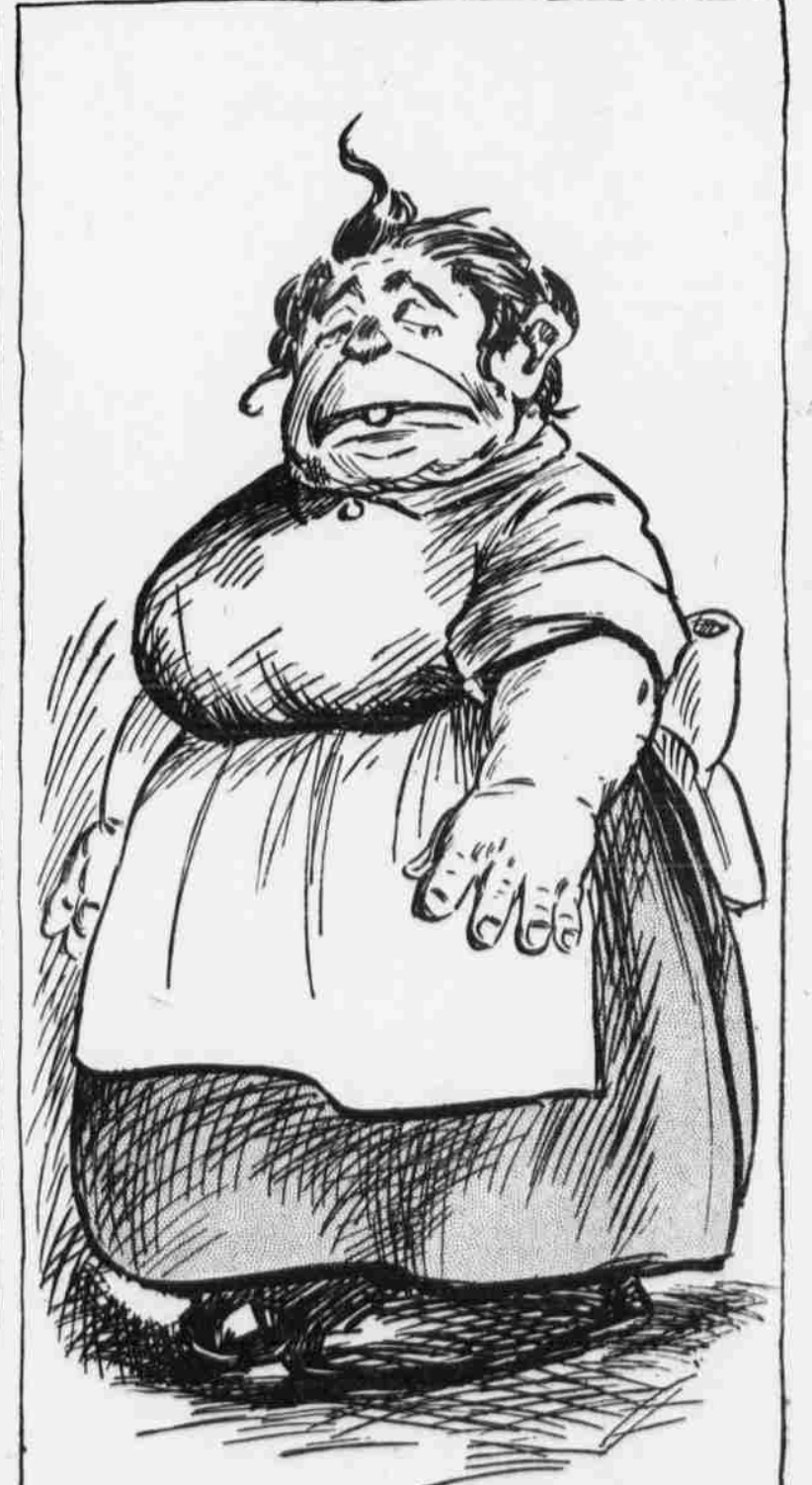
To the Ruler of the Kitchen

Dear Duchess, I admire you so— That's why I never like to stop Arranging pleasant plans, you know, To cheer you and your faithful cop. O, Duchess, when you get your palace, Do not forget kind little