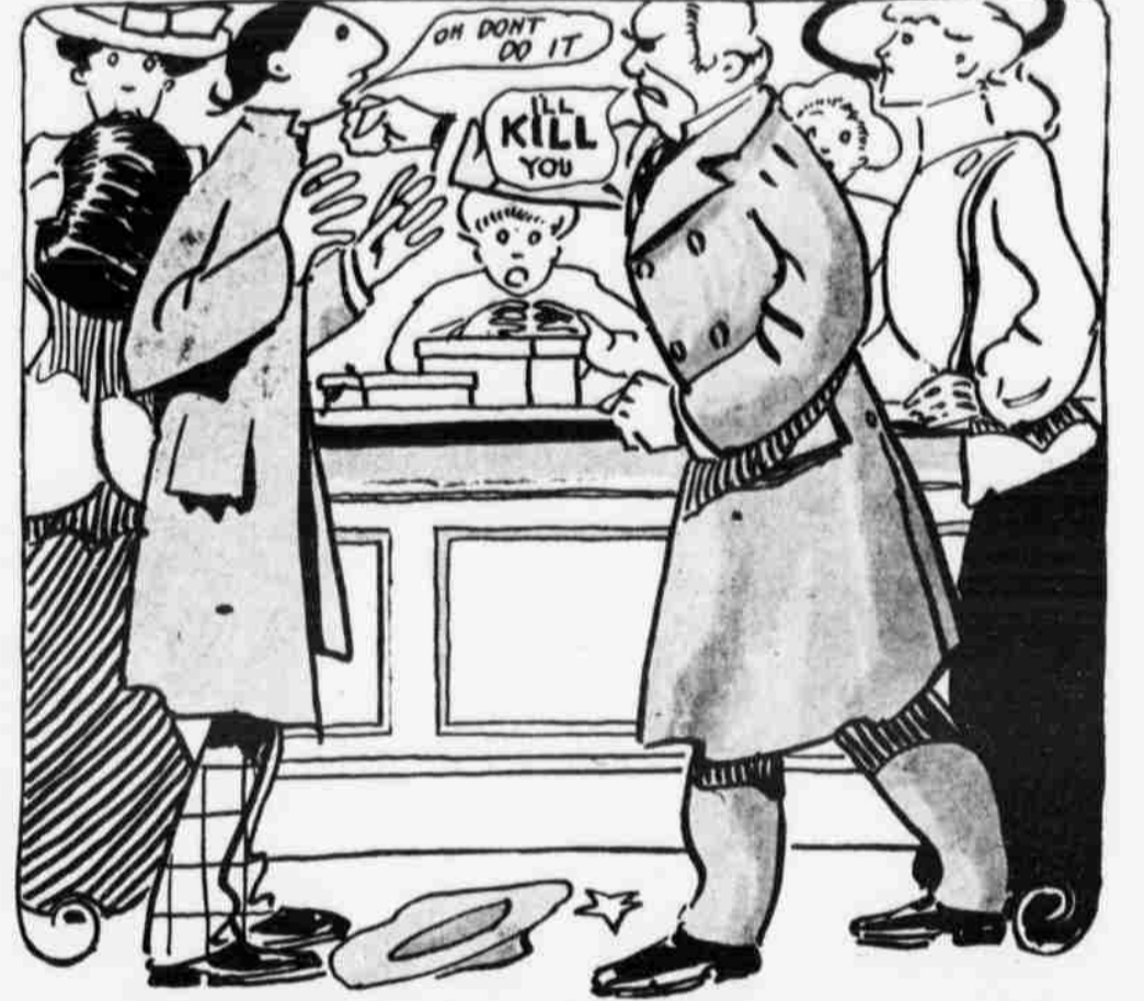
"I didn't know you were the s-s-silent partner of the firm."