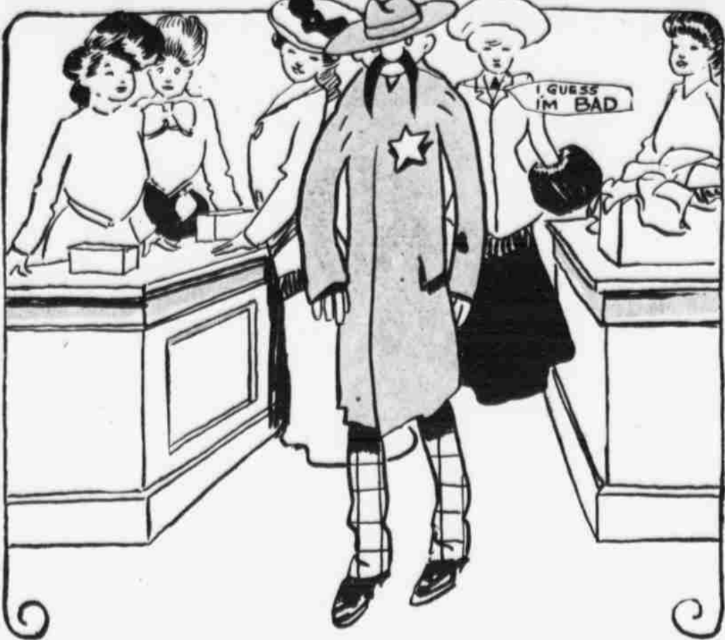
"At last my intuitive mind is recognized. I have been made the store detective."