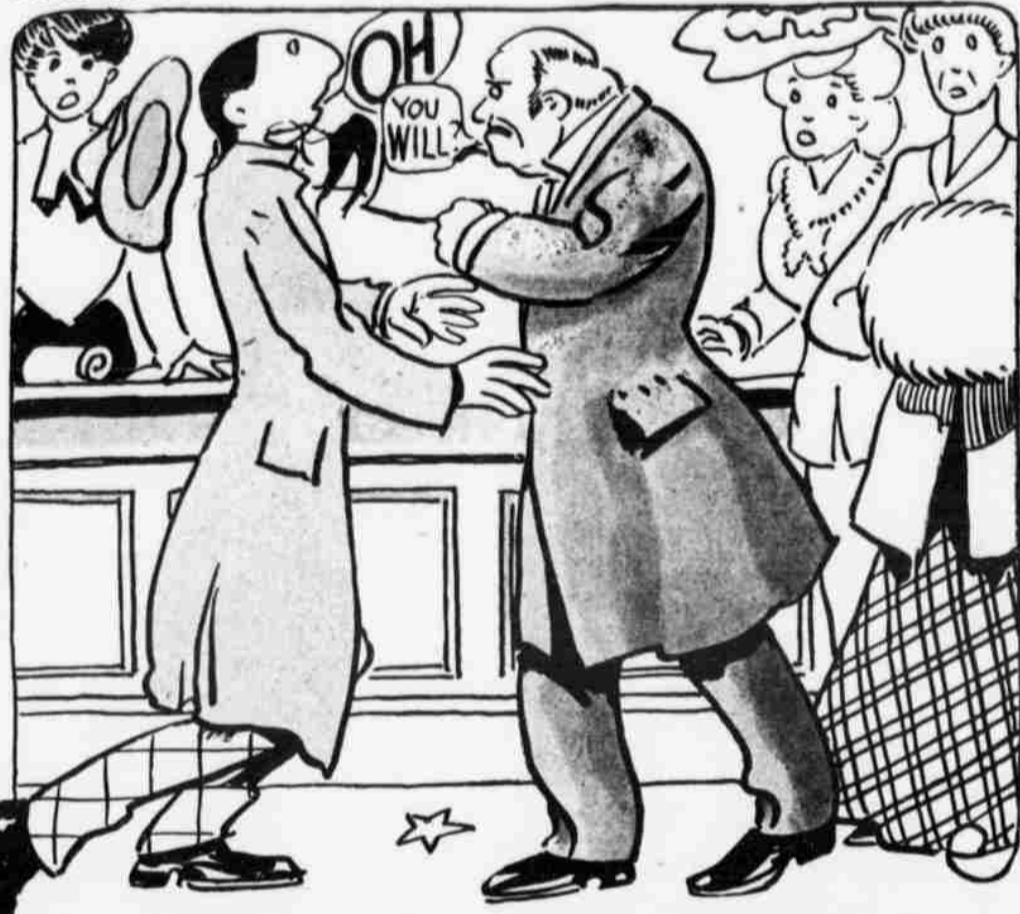
"Wha—wha—who— S-s-s-ssy, s-s-s-sir, I didn't kn-know you were the s-s-s-s—"