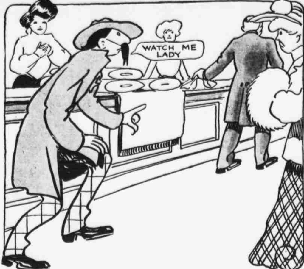
"Aha! I have long had my suspicions of yon person. See him go from counter to counter, picking things up and putting them down."