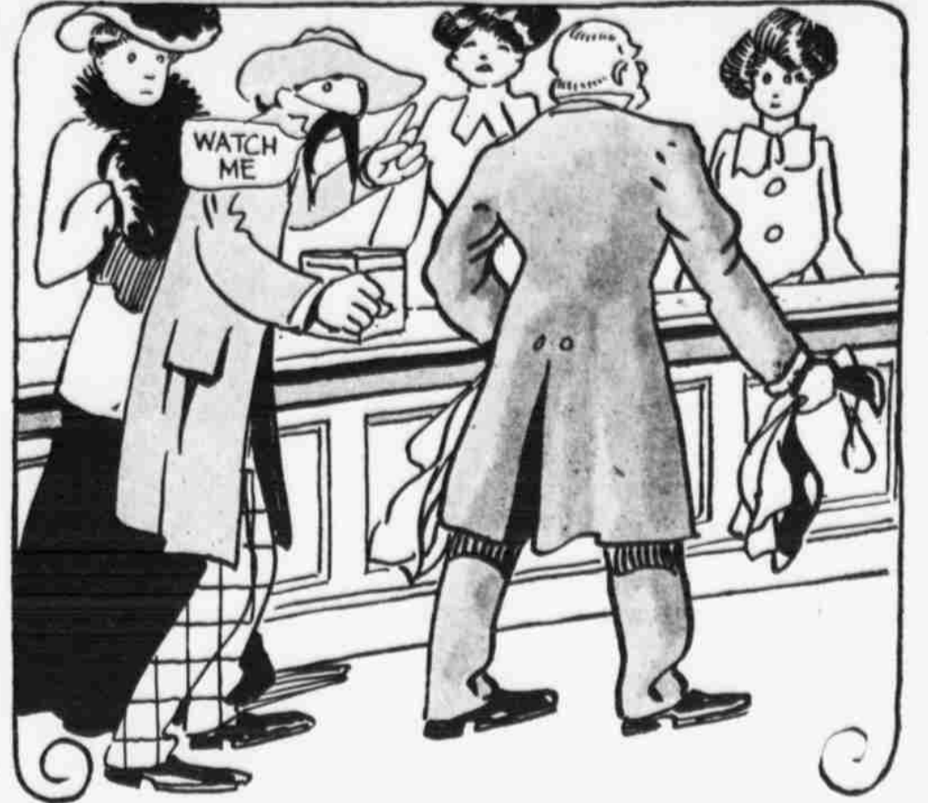
"Ssst! One more suspicious move and I nab him. I've got Sherlock Holmes backed off the boards."