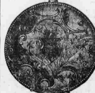
Jas. Boss 14K Gold Filled Guaranteed 25 years 15 Jeweled Elgin Movement Hunting Case