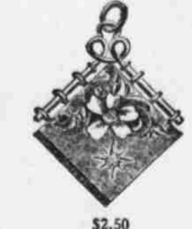
Chatelaine Beautifully Enameled in plors and Newest Designs Fine Jeweled Movement