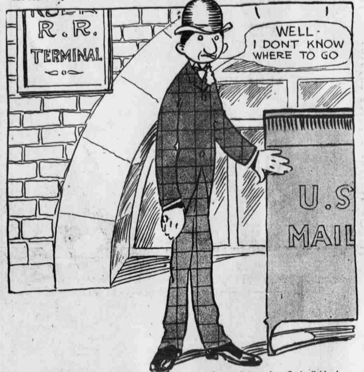
"And they discharged me just because I asked her what Springfield she wanted. The superintendent said I ought to have sold her a ticket to the Springfield this road reaches. He says I am too obliging to sell tickets, anyhow. I believe I will try farming."