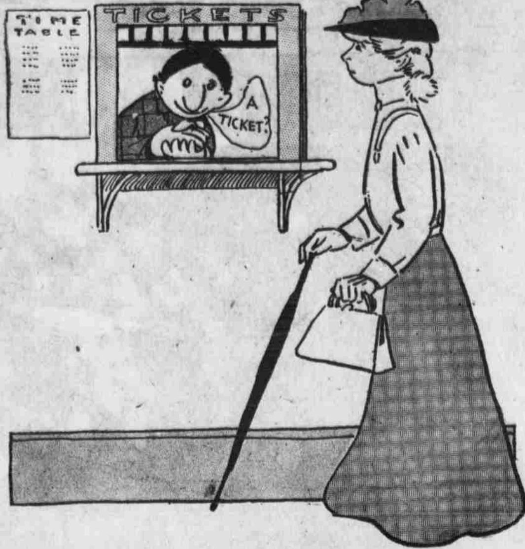
"Good morning, ma'am. A ticket? Yes, ma'am, that's what we sell here. No, ma'am, I didn't suppose you wanted to buy a ton of coal. Of course, I knew you wanted to get a ticket. Where did you wish to go?"