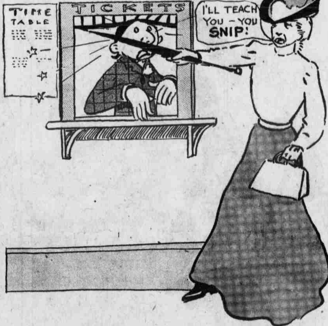
"—you mistake me utterly. I was NOT getting smart. I am NOT a FLIP person. I beg of you not to report me. How was I to know— O, there she is gone."