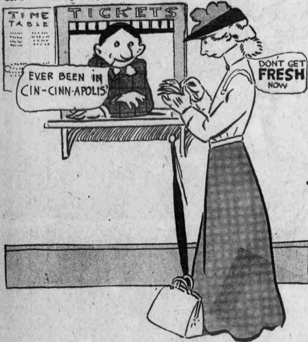
"Certainly, ma'am, I'll wait until you say where you want to go. To Springfield? Springfield, Illinois, Massachusetts, Ohio, Missouri, or where, ma'am?"