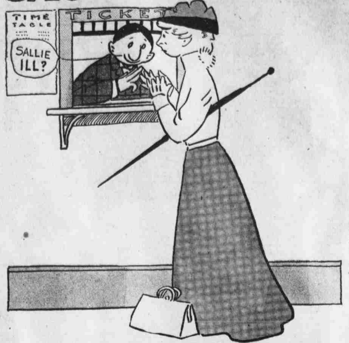
"Yes, ma'am, as you say, your cousin Sallie is quite ill, and you have had to give up your visit to Cincinnati. Now, a ticket to Cincinnati will cost you $8. The round trip rate is"—