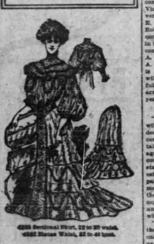
4828 Central Street, 22 to 25 waist. 4828 Kansas Street, 22 to 48 waist.