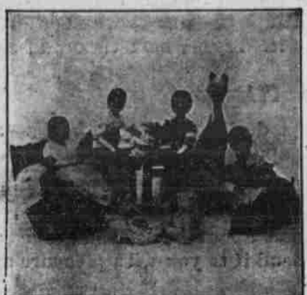
FROM "RHYMES OF REAL CHILDREN"—FOX, DUFFIELD & CO.

This is one of a series of books for little folks, by Florence and Bertha Upton; and in originality of illustration it certainly is ahead of anything we have seen. Each page of verse is faced with a picture, something unique, and after the child's own heart, gaudily colored and out of proportion with immense heads and wooden limbs, black faces, clowns and all the kaleido-