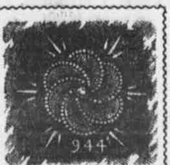
Grecian Scroll Breech A dainty design copied from a classic found in Athens. Beautifully engraved, with a sparkling, fisshing alone in the center. Cannot be told from original brooch costing $55. Our price $1.50