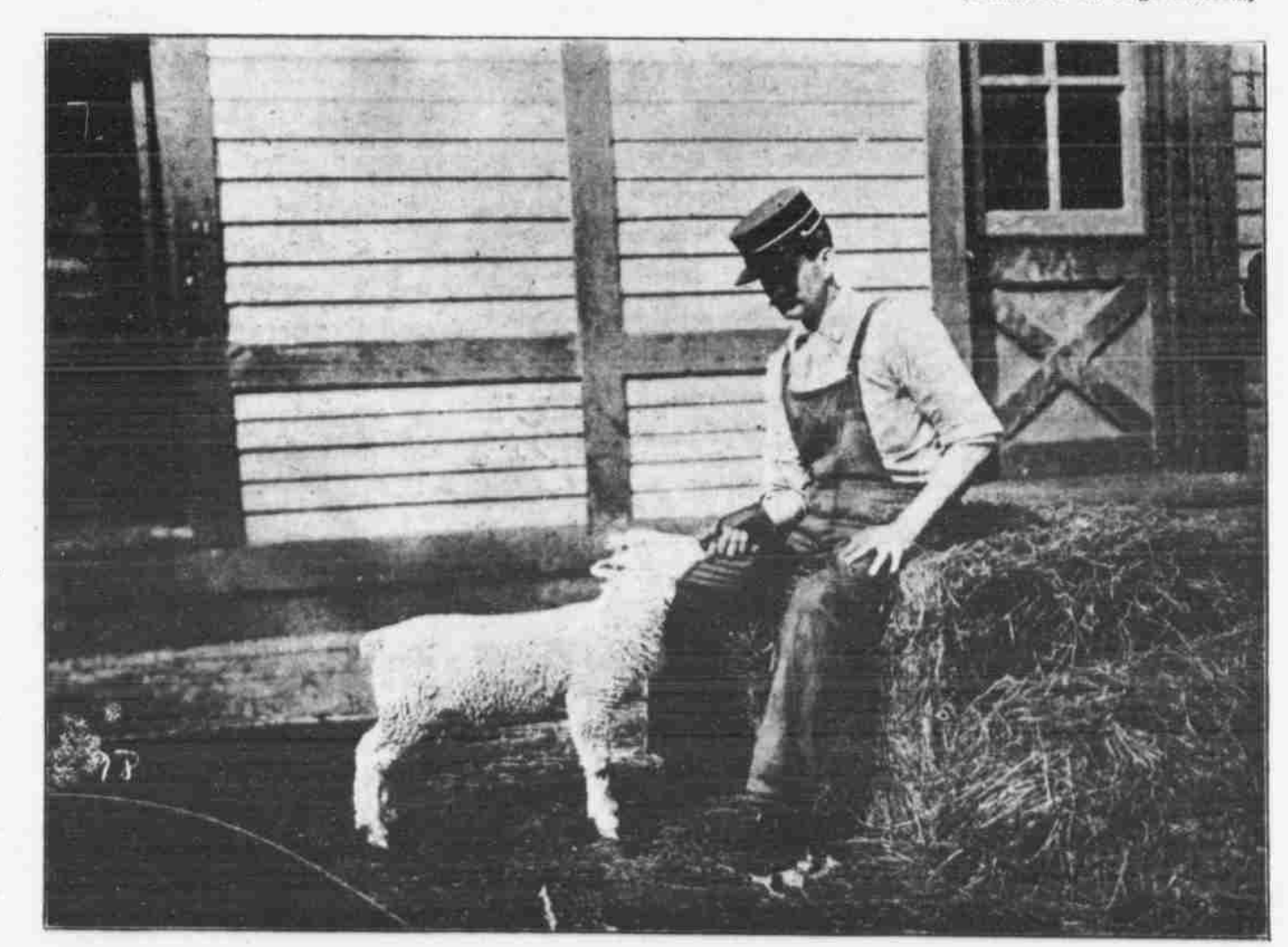
FEEDING THE BABY AOUDAD FROM A BOTTLE.