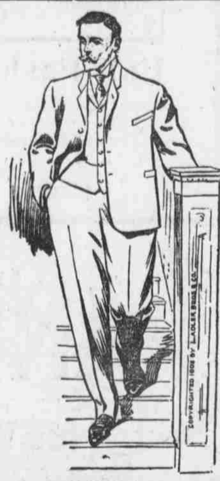
Suit Prices $7.50, $10, $12, $15, $18, $20, $22.50, $25, $28, $30 and $35