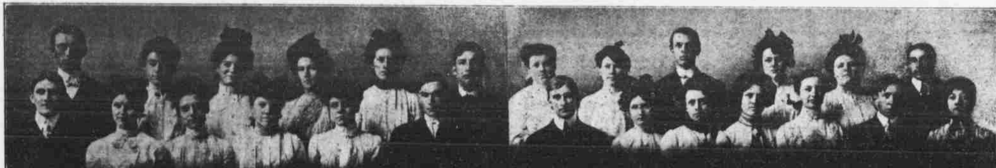
GRADUATING CLASS, 1903, HASTINGS (Neb.) HIGH SCHOOL.