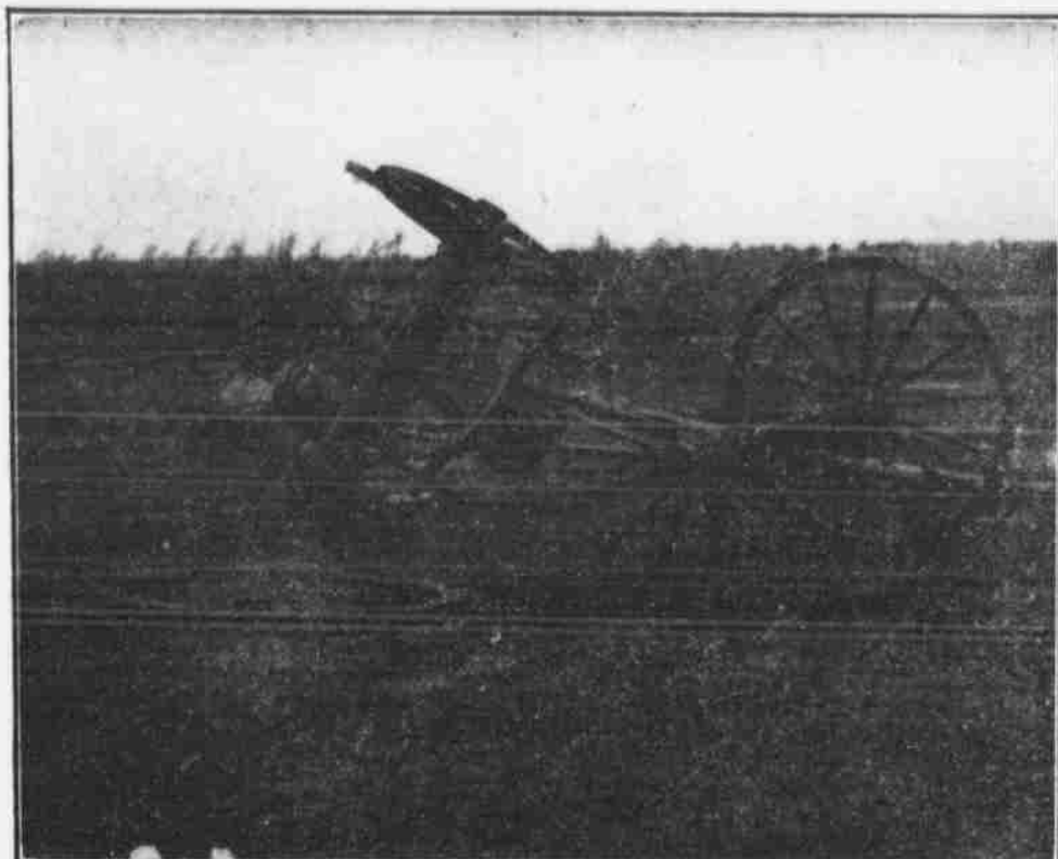
ONE TIRE WAS STRAIGHTENED AND ONE BENT UP INTO A BALL.