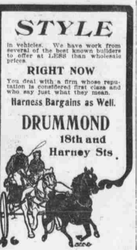
STYLE. In vehicles. We have work from several of the best known builders offer at LESS than wholesale prices.

MEN WANTED FOR THE UNITED STATES ARMY, machinists, firemen, coal passers, electricians, ship fitters, steam ordinary seamen, landmen, apprentices and mess attendants.