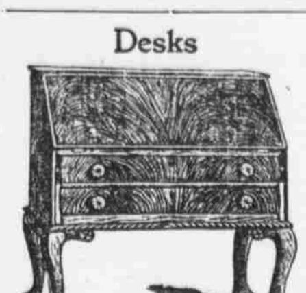
Desks. Beautiful design Sideboard, made of the choicest quarter-sawed oak and finished like piano, French plate mirror 18x40, beautiful hand carved figures at top, hands all brass hand veneer, beautiful claw feet. Price $55—

We Are Right in Touch With Santa With all the latest novelties of this season's manufacture in FURNITURE, CARPETS AND CURTAINS.