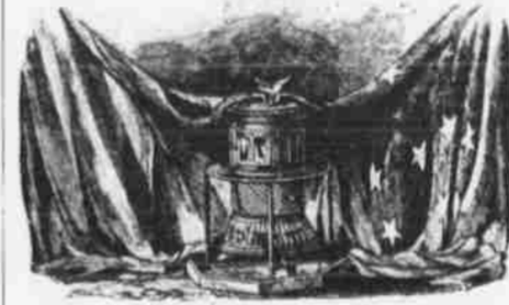
or range repairs when all such supplies can be had from the OMAHA STOVE REPAIR WORKS, 1207 Douglas, Omaha, Neb.

THIS STOVE WAS NAMED "TROPIC"—and is a good name for a stove to take on a trip to the North Pole. This stove was on exhibition at the 33rd American Institute Fair in New York, and is the identical stove used on the relief steamer "Bear", which found Lieutenant Greely and his half frozen and starving companions, by Commander Schley, at Cape Sabine, January 22, 1881. Had Commander Schley found it necessary to replace the linings and grate for this stove he could have secured them through an Omaha house, that ships stove repairs to all parts of the Western Hemisphere. Shipments to Canada, Mexico, California are of daily occurrence, and why should Omaha, Nebraska or Iowa people think of sending away for furnace, stove