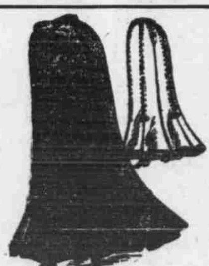
4257 Nine Gored Slot Seam Skirt. 22 to 30 waist.

Woman's Nine-gored Skirt, with Inverted Plaits Stitched to Form Slot Seams, 4257-Perforated dip in front. Slot seam effects tary honors. These were Lieutenant Colonel are much in vogue and are seen upon Charles Porter, a retired infan;ry officer many of the smartest suits and skirts. This stylish model is admirable in every way and is appropriate for all skirt and suit materials, but, as shown, is of snewflake cheviot stitched with black silk and trimmed with pointed bands piped with plain black and held by ernamental but-