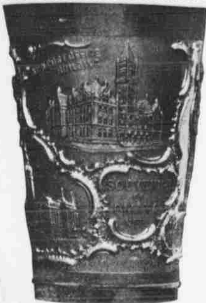
Omaha Souvenir Cup.

ESTABLISHED 1884 Manufacturer to Consumer