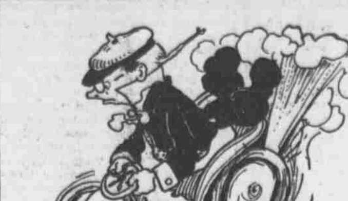
the express route to health and vigor. Sweet, crisp flakes of wheat and malt—eaten cold.