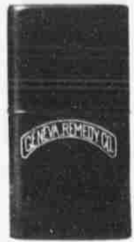
Miniature Natural Inspirator closed ready for pocket or dresser.

So Compounded as to form a pungent, strongly medicated vapor. The particles being separated and fixed as to float and go wherever the breath goes, which by use of the Inspirator, is easily made to fill every cavity, tube and cell of the Nose, Head, Throat and Lungs. Thus applying the remedy to the very seat of the disease. No other Instrument or Remedy known to the medical world can accomplish such results. It cures a cold in ten minutes, an ordinary cough cannot last over night. It is a perfect germicide and death to microbes. It cures hoarseness and is used by public speakers and singers everywhere.