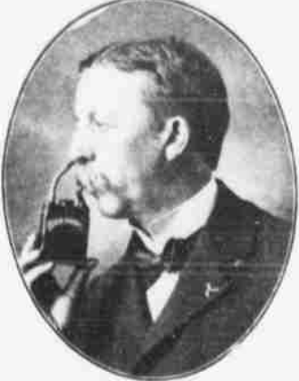
Miniature natural inspirator in use. It is neatly constructed of vulcanized rubber, can be carried in the pocket and is an ornament to the dressing case.

The Natural Inspirator lasts a lifetime; is always ready for instant use and never fails of immediate results. Manufactured only by the Geneva Remedy Co. For Sale by Myers-Dillon Drug Co., 16th and Farnam Sts. J. H. Schmidt, 24th and Cuming Streets.